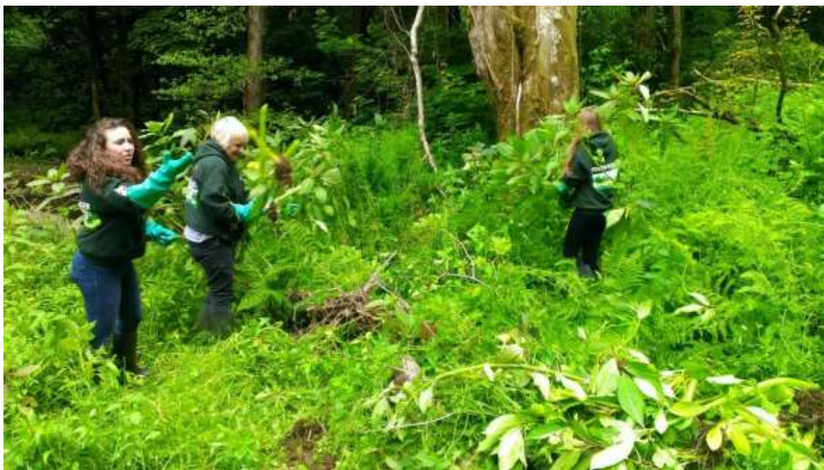
Youth Rangers pulling Himalayan balsam

headwaters of the target catchment and a risk to it), assisted by a financial contribution by Natural Resources Wales.