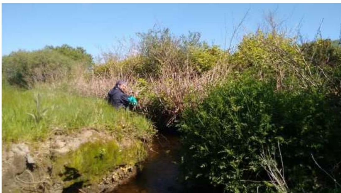
Impaired knotweed regrowth (May 2016)