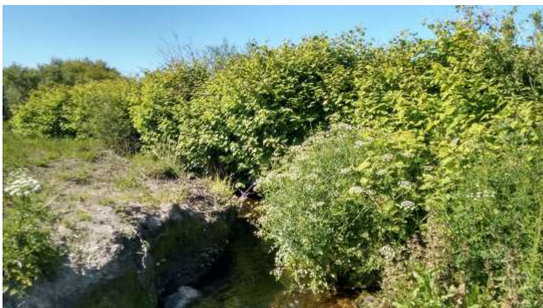
Knotweed prior to May 2015 treatment

Treatment at one site was compromised due to flooding in 2015 and a tree fall disturbing knotweed further in 2016.