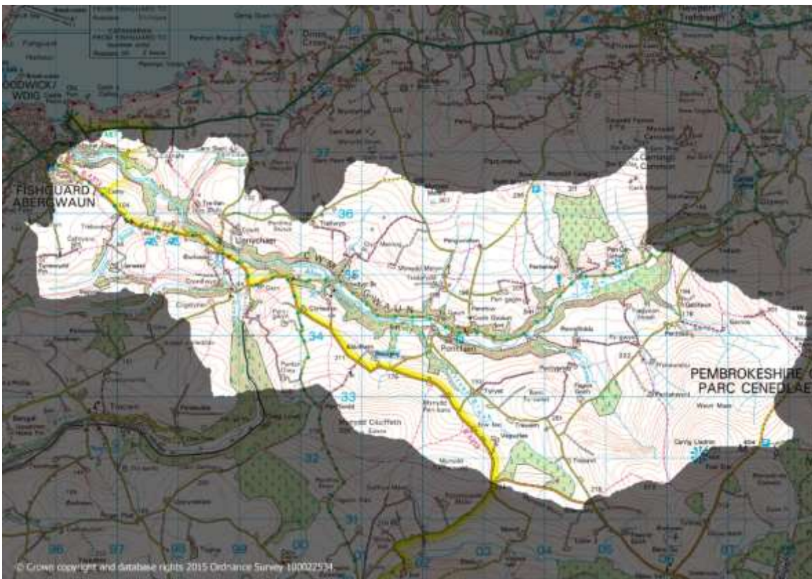
The project area

The project has resulted in a greater knowledge of the extent and degree of the three target Invasive Non-Native Species (INNS) - Japanese Knotweed, Himalayan Balsam and Rhododendron ponticum - within the Cwm Gwaun catchment. The catchment control approach adopted can be described as "top down and outside in". This was determined to be the most cost-effective way to protect the largest area and the most ecologically-sensitive parts of the catchment, while minimising reinfection risk along watercourses.