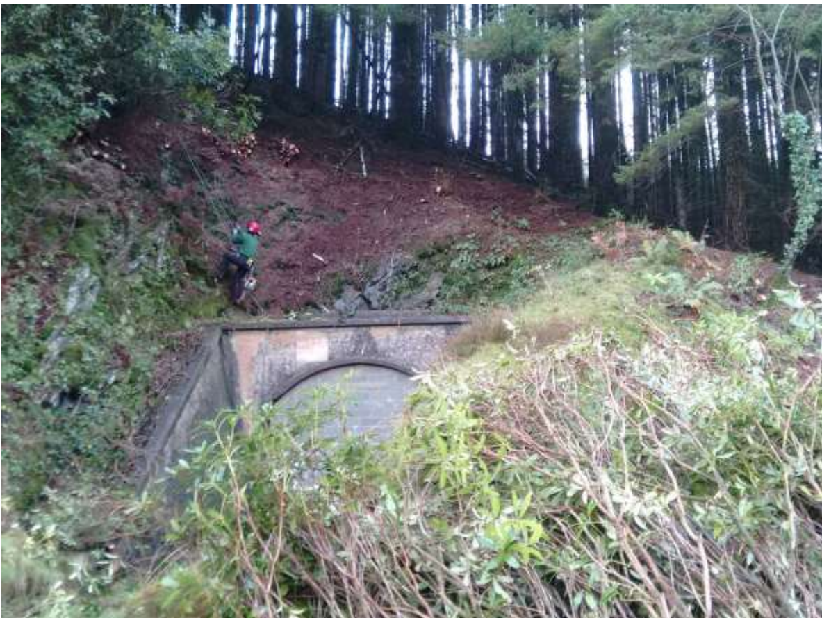
Cutting Rhododendron on steep slopes

Rhododendron control sites will require post-project monitoring for regrowth and restoration.