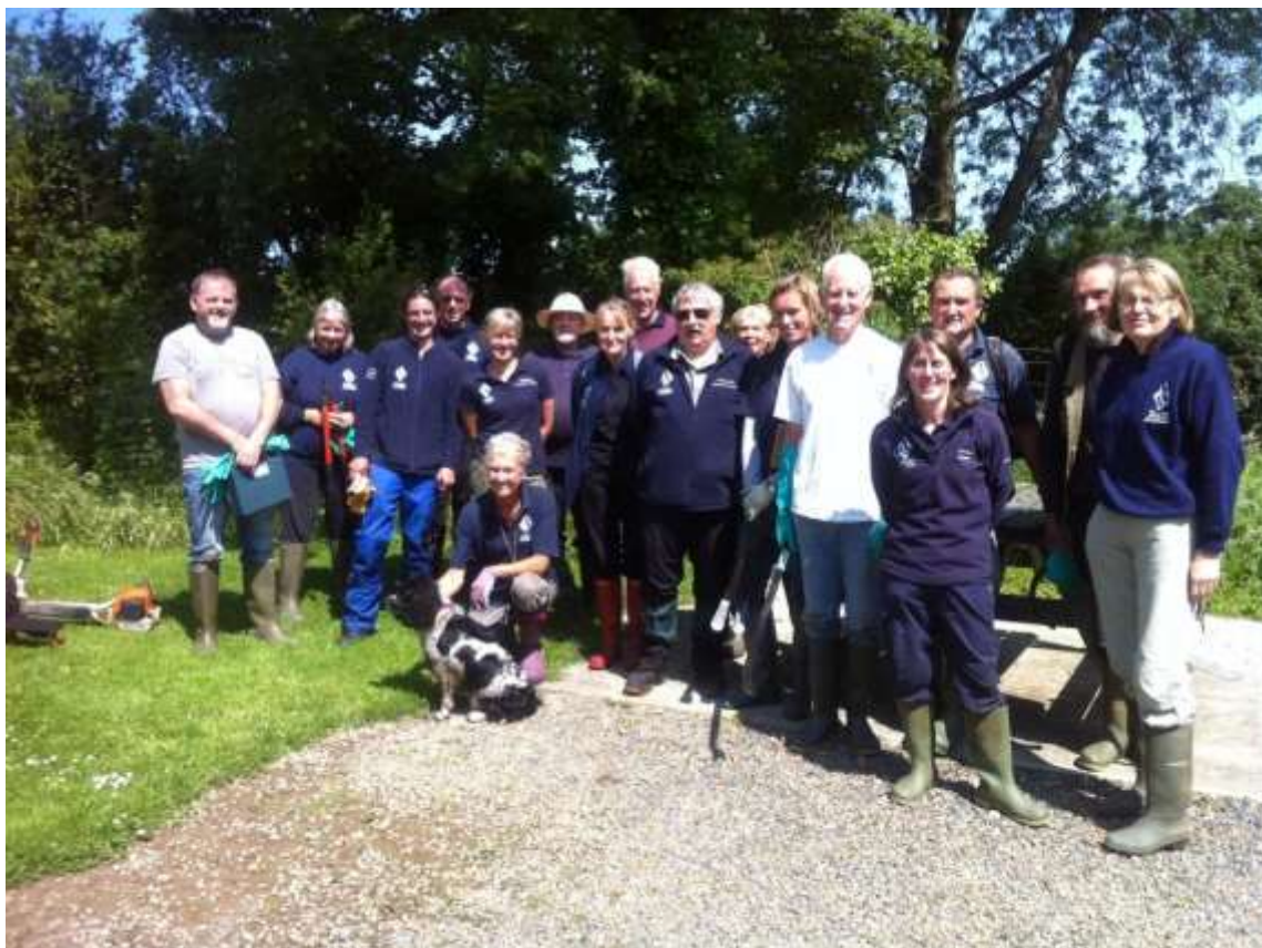
Friends of Pembrokeshire Coast National Park work party