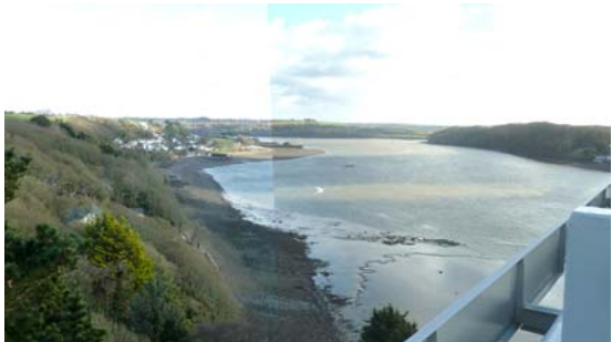
Looking east from Cleddau Bridge