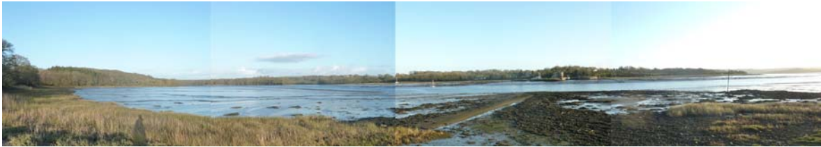
Near Picton Point on Daugleddau