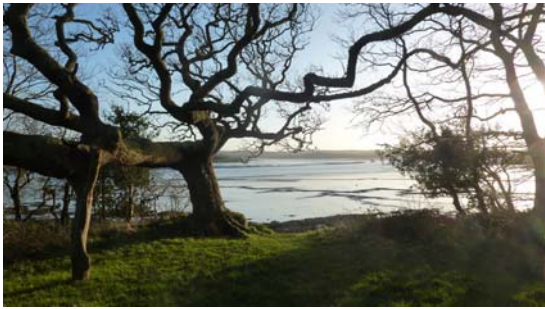
Ancient oaks at water's edge