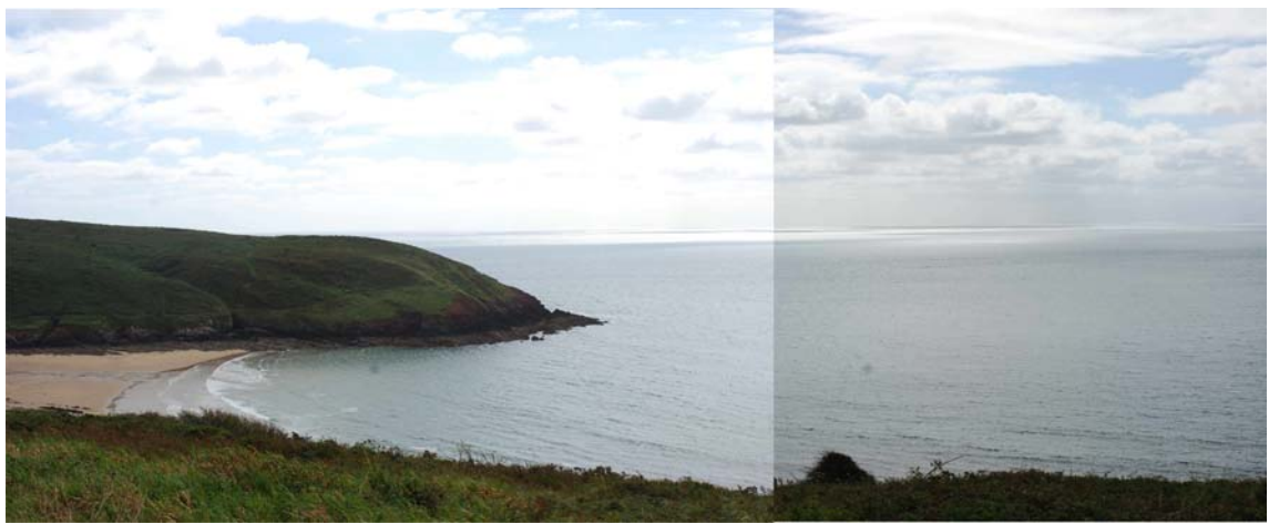
Manorbier beach and the Priest's Nose