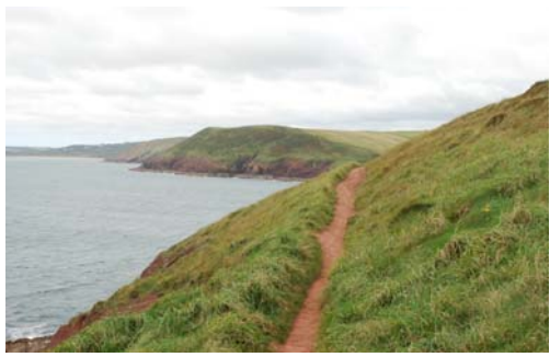
Cliff path on the Priest's Nose looking west