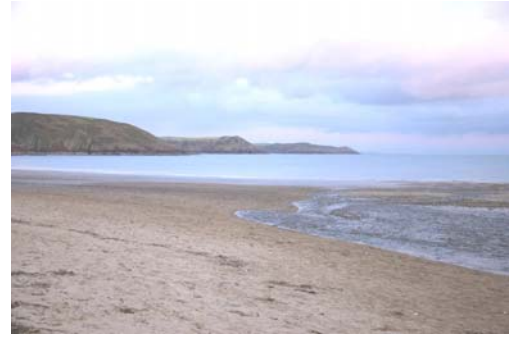
Freshwater East looking east