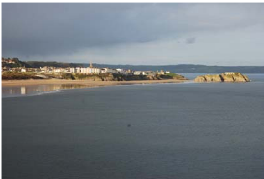
Tenby with snire from the south