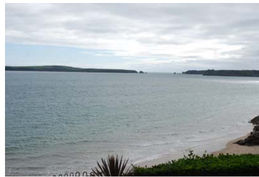
View across to Caldey island from South Beach