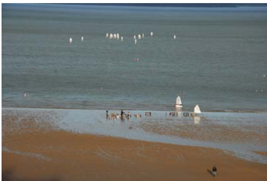
Tenby- sailing dinghy activity off North Beach