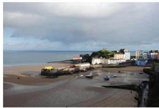
Tenby North Beach with harbour