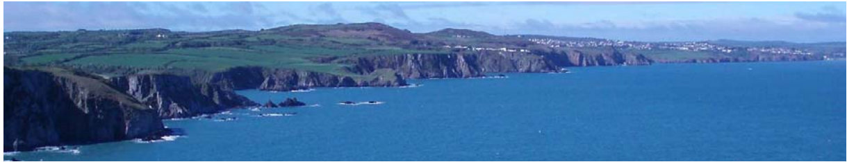
Looking from Dinas Head south-west towards Fishguard