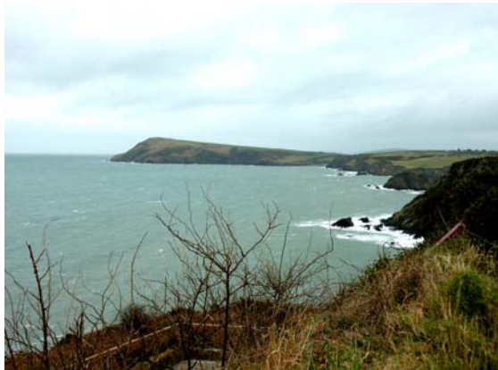
Looking east to Dinas Head from caravan park at Penrhyn