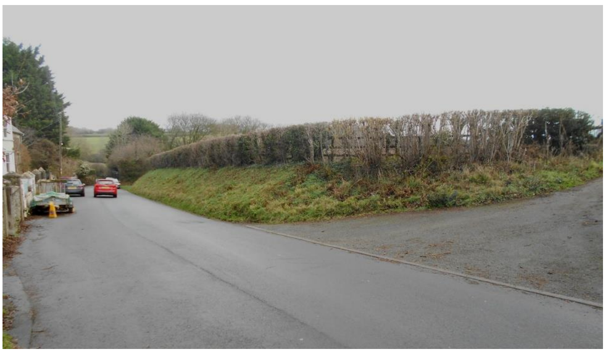
Candidate Site Reference 88A, Newport showing existing field access from Feidr Pen-y-Bont and roadside hedge. Existing residential properties lie to the left

HA3, the applicants' site, is therefore the only proposed allocation that has not been commenced and which is proposed to meet the estimated need within the next 12 years.