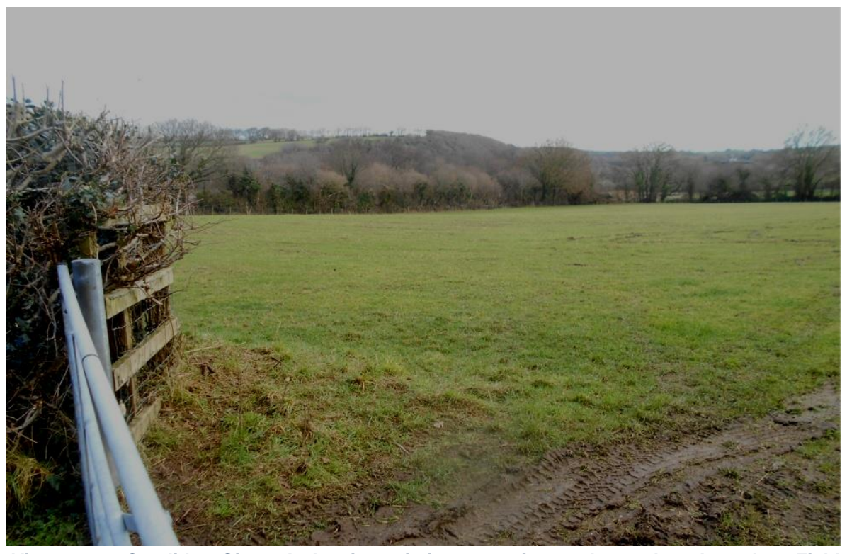
View across Candidate Site 88A showing existing screening on the northern boundary. Field slopes gently from south to north