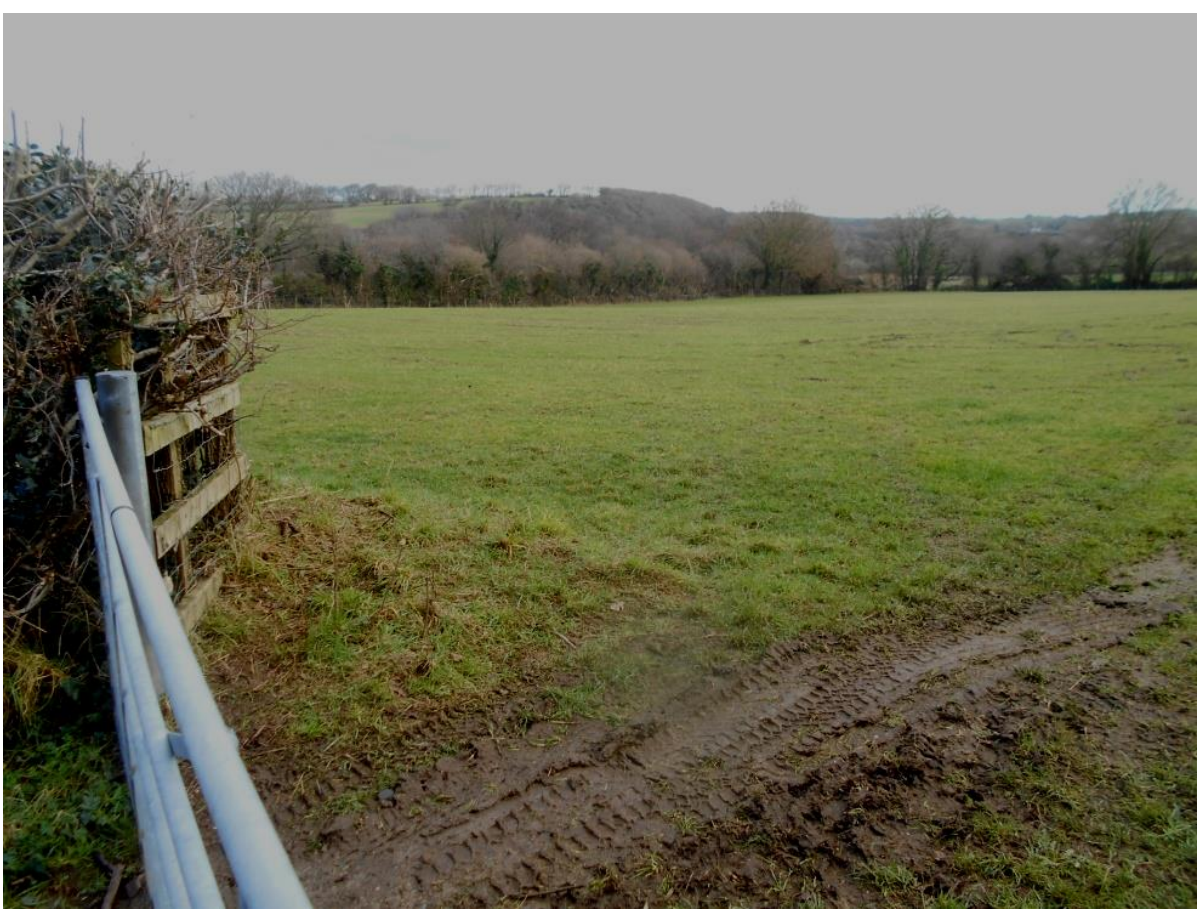
View across Candidate Site 88A showing existing screening on the northern boundary. Field slopes from south to north