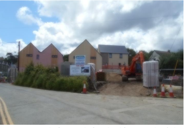
Former Pottery Site HA2. Social housing units near completion and view looking south of the commenced second phase for market housing