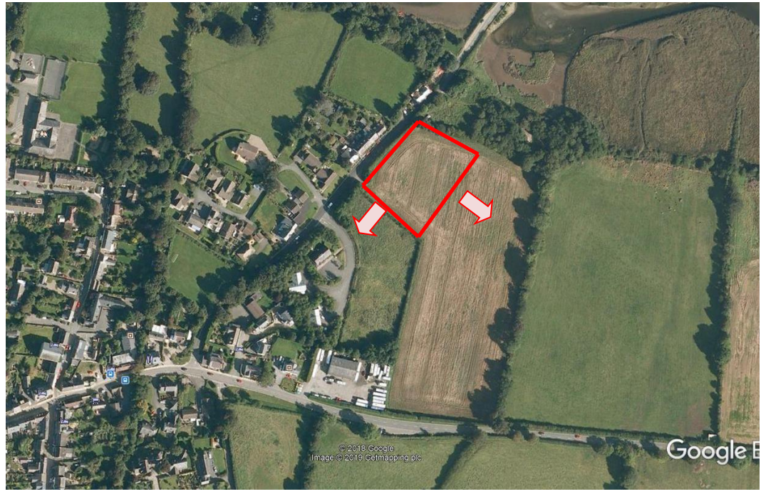
Aerial photograph of Focussed Change site