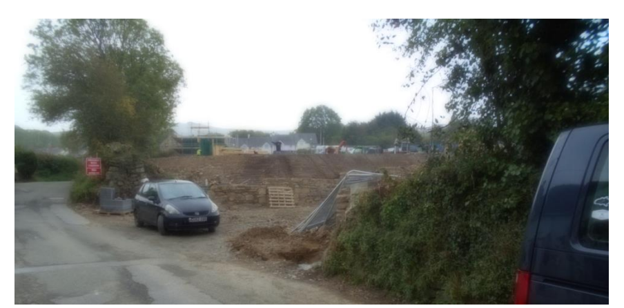
Site HA1. Access point from Feidr Bentinck to 35 unit site of which 14 are affordable homes. There is a second access from Feidr Eglwys

In respect of HA1, which is described to be for 35 properties of which 14 are for affordable housing (by Wales and West Housing Association), the site is now advanced and units are being completed..