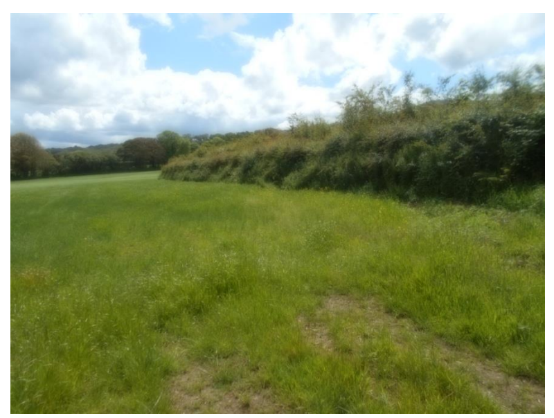
Southern boundary hedge to HA3 and showing further mature hedge to rear of applicants' ownership

In respect of HA3, earlier proposals by the NPA indicate that the 15 property site should be developed in two stages; "the NPA envisages only 10 homes will be completed in the five year period 2026-2031 leaving the remaining 5 to be completed post 2031" (Source:-Appendix 2 Housing land Supply as at April 2018 by NPA and as referred to in our Focussed Change submission dated 13<sup>th</sup> February 2019).