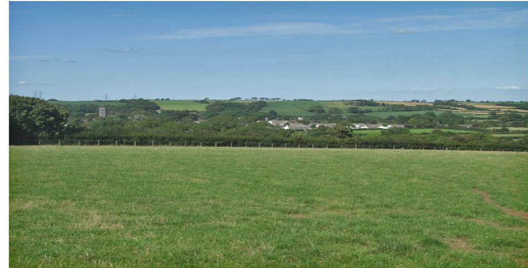
Southern edge of Lamphey viewed from the National Park boundary on the B4584 south of the village

The southern edge of Lamphey facing onto the National Park is softened by the dense deciduous woodland belts and hedgebanks in the locality. There is no scope for development between the southern edge of the village and the National Park without the effect of encroaching into open country-