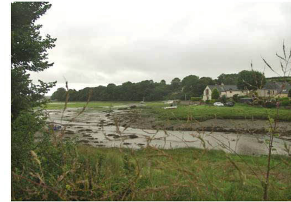
South eastern edge of Llangwm, overlooking the edge of Guildford

The National Park boundary crosses the middle ground in this view, running across Llangwm Pill