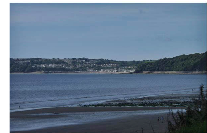
View from Amroth

This view across part of Saundersfoot Bay shows the setting of the town in relation to the local landform. Any in-fill residential development should not breach the skyline of Saundersfoot