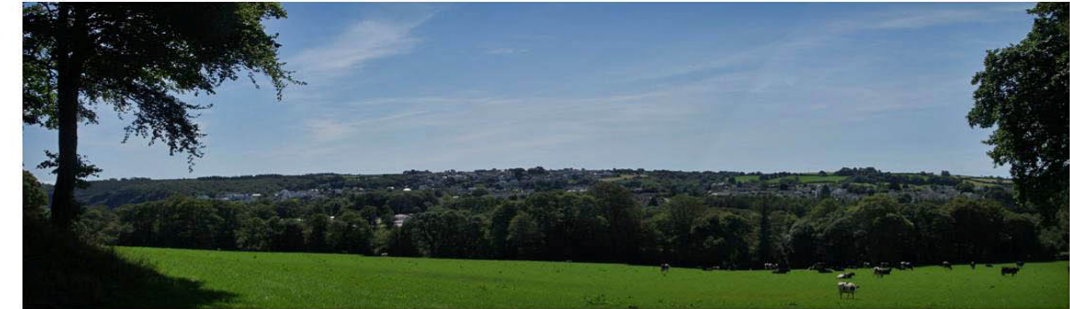
Part of the town viewed from the north east near Hean Castle

Saundersfoot – a large compact, nucleated town settlement set within rolling landform on the coast, in two main areas separated by an area of lower-lying open land which contributes to the local landscape character and allows for views down to the sea from inland areas. The old core of the town fronting the small harbour has a Conservation Area. The urban area sits within a wider context of parkland to the north and the coast to the east. There are attractive easterly views over Saundersfoot Bay