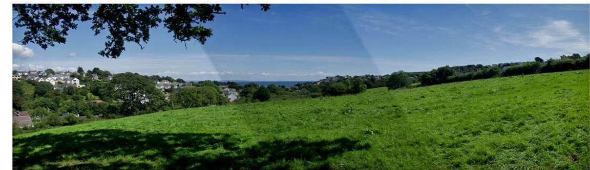
View east from Hopshill Lane, a minor road west of the town

The Ridgeway area of the town is mostly set beneath the skyline