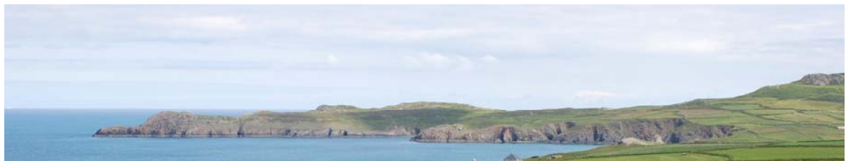
St David's Head looking across Whitesands Bay from Carn Rhosson