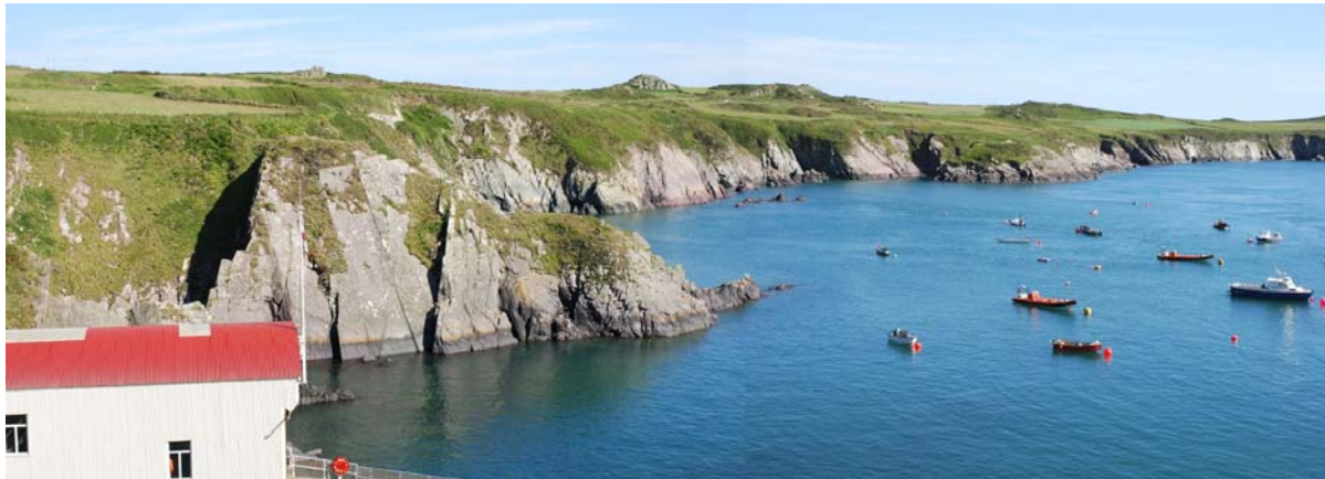
St Justinians with Lifeboat station and moorings