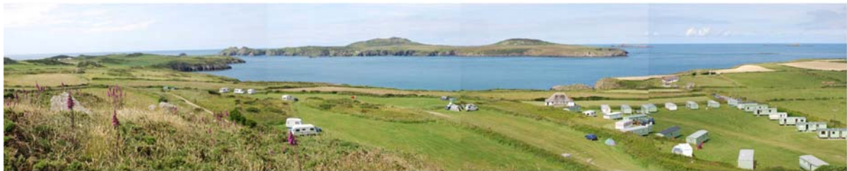
Ramsey Sound viewed from Carn Rhosson