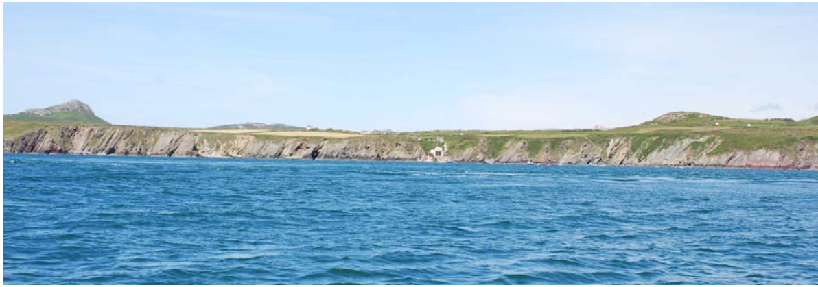
Mainland coast from Ramsey Sound- the lifeboat station is centrally located with Carn Llidi to the left and Carn Rhosson to the right