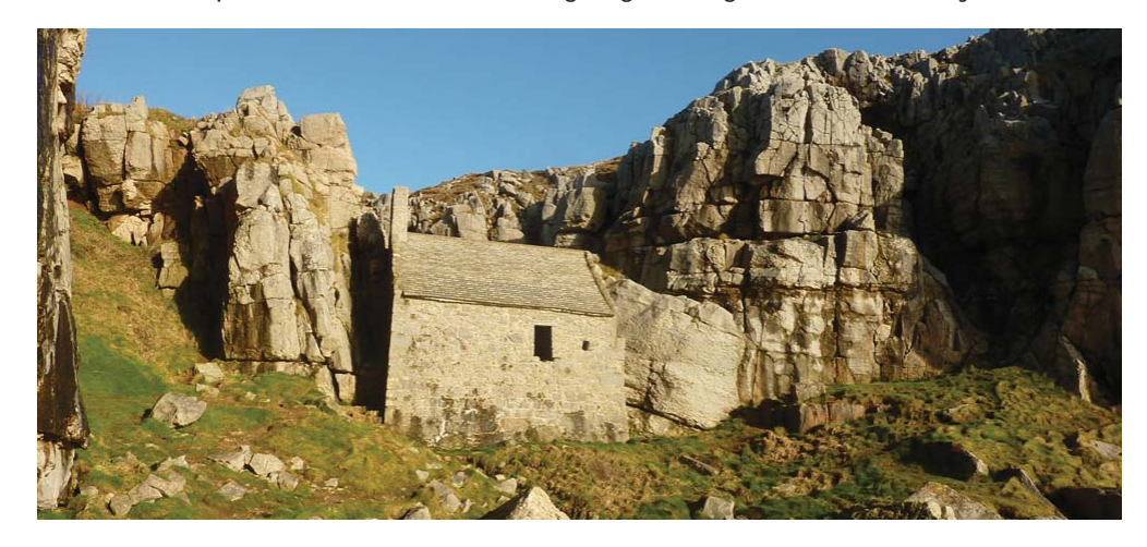
St Govans Chapel