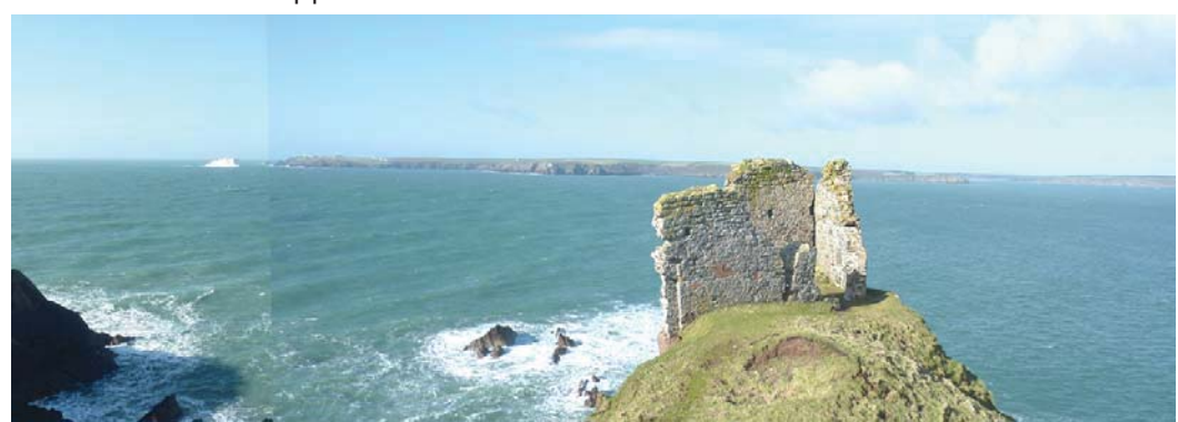
The mouth of Milford Haven

3.25. Milford and later Pembroke Dock were the sites of royal navy dockyards from the eighteenth/nineteenth centuries until the late twentieth. There is a particular cluster of defensive sites all around the coast of Pembrokeshire, more marked than in any other area of Wales. From the time of Thomas Cromwell, its overall strategic importance has been recognised - though the French landing at Strumble Head was easily repulsed. Naval ship-building was established at Neyland c. 1760 and at Milford Haven in 1796. It was relocated to Pembroke Dock in 1812, which became one of the most important naval ship-building centres in Britain. Facilities were substantially extended in 1830-32 and again in 1844. Such was the area's importance in strategic terms that forts were built to quard the Haven from possible attack by the aggressive government of Napoleon III. Decline set in after the introduction of the Dreadnoughts and the dockyards finally closed in 1926. Civilian dockyards were also established here. During World War II Pembrokeshire played an important role in the Western Seaboard Defences strategy, when there were twelve airfields in active operation. Remains are still apparent such as the look out on Carn Llidi.