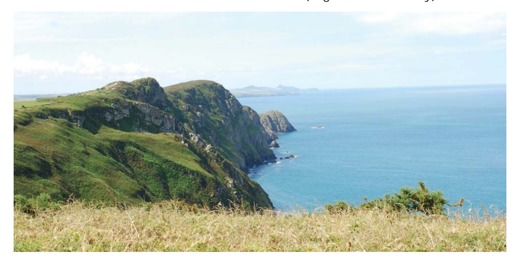
High clffs at Penbwchdy

transition from marine to non-marine conditions is shown by the change to redbed deposition of the Old Red Sandstone (e.g. St Anne's Head at 46mAOD high, Freshwater West with its wave cut platform, Freshwater East and Pendine). This continues into the Devonian, represented by red sandstones and mudstones laid down on coastal plains, mudflats, salt marshes and in braided rivers. These terrestrial environments were inhabited by early plants, armoured fish and amphibians. The collision of continents created folds and faults which is widely evident in the cliffs of north Pembrokeshire (e.g. Abereiddi Bay).