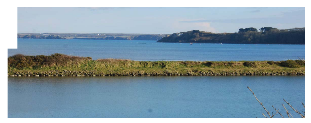
Lagoon at Dale

Migratory fish including sea trout and salmon are found in many watercourses, most famously on the Teifi.