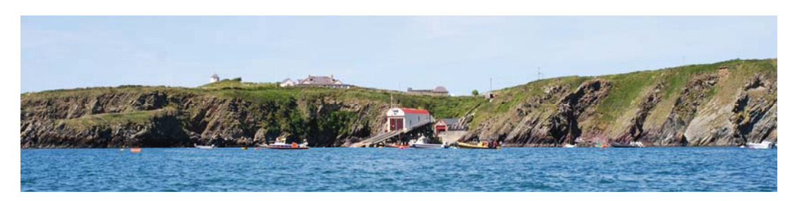
St Justinians from Ramsey Sound