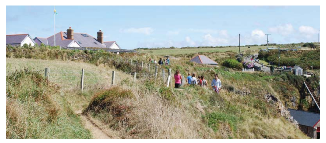
Coast Path at St Justinians- a popular stretch

3.29. Coast walking along the Pembrokeshire Coast Path National Trail (part of the Wales Coast Path) and linked paths is very popular. Over 67,000 visitors used the coast path in 2012. The coast path is 300km long due to the highly indented and complex nature of the coast. Certain stretches are used more intensely than others- mainly those close to the honeypots such as Tenby and Whitesands Bay etc. Another popular recreational activity is kayaking due to the relative ease of access to the water. Other launchable craft that are popular are day motor boats and sailing dinghies out of most beaches with slipways. Sea angling is also popular from both the shore and boats which can go some way offshore.