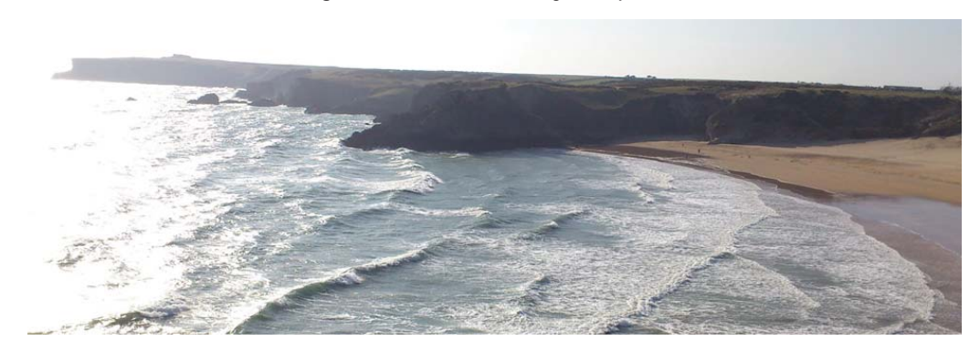
Waves at Broadhaven

the west facing coasts and lower along Carmarthen Bay and the adjacent sheltered south east facing coast such as at Lydstep and Saundersfoot.