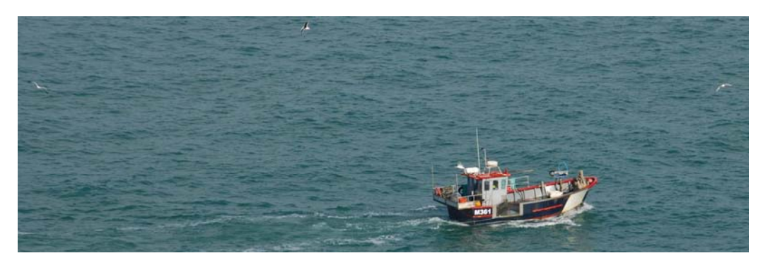
Potting fishing vessel off Strumble Head

3.33. Commercial shipping on the Milford Haven Waterway, primarily of gas [LNG] and oil, along with the ferry terminal at Pembroke Dock, makes this area one of intense activity. This is further intensified with the leisure use.