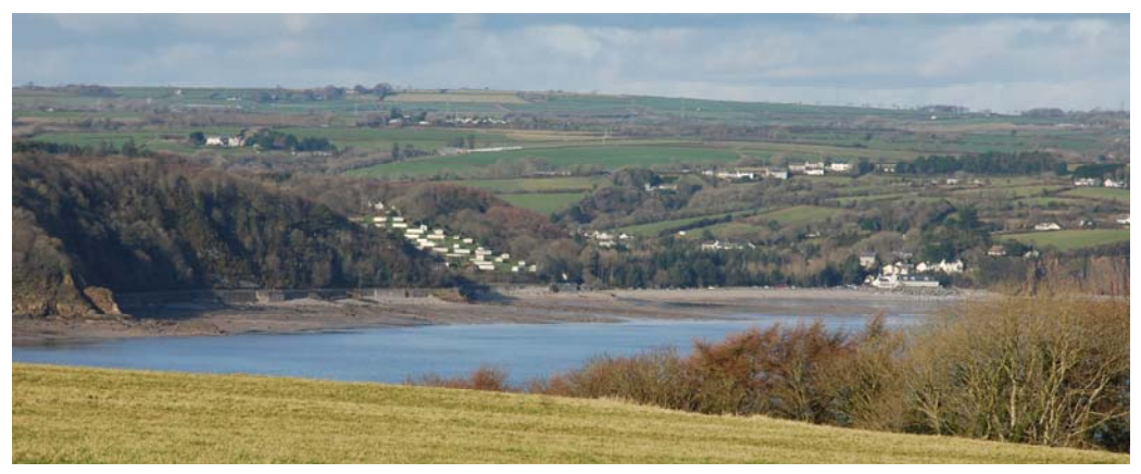
Caravans at Wiseman's Bridge

3.28. Pembrokeshire is established as a popular tourism destination especially around its coast. These tourists are increasingly looking for coastal recreational activities whilst on holiday or coming to the area specifically to participate in such activities. The intensity of use relates to the ease of access with places allowing vehicle access close or on the beach being popular honeypots such as Tenby, Saundersfoot and Amroth to the south east and Newport Bay and Whitesands Bay to the north and west. Other coastal locations are very remote allowing access only by small boat. Activities can vary from general beach activities which are popular at the many good, clean beaches to the more strenuous activities of kite surfing, climbing, diving and coasteering which was invented in the area. The intensity of use is also determined by school holidays as well as the weather.