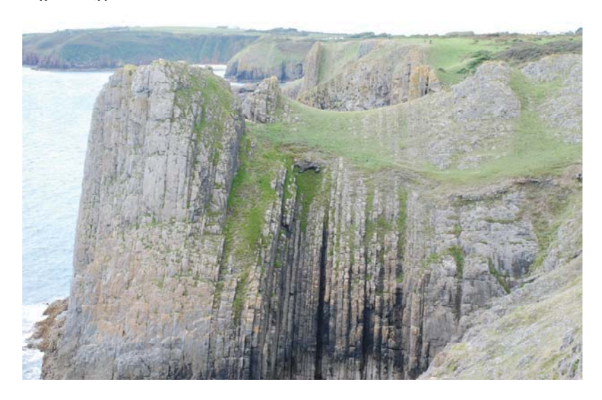
Carboniferous limestone cliffs: Whitesheet Rock

3.6. Upper Devonian sedimentation continued in red beds, representing sediment deposited in rivers and on floodplains as the mountains eroded. The Carboniferous saw a return to marine conditions, with the Carboniferous Limestone laid down with shoals and lagoons (rich in corals, brachiopods). The Limestone forms prominent headlands and is exposed in steep coastal cliffs in south Pembrokeshire (e.g. Linney Head at 40mAOD high, Trevellen, Stackpole at 35mAOD high). This limestone coast displays distinctive erosion features such as stacks, caves, arches and blowholes. In mid to late Carboniferous times sedimentation changed to sandstones and mudstones of rivers and delta plains vegetated by giant ferns and horsetails. The peat swamps form the source for coals of the Coal Measures (Pembrokeshire Coalfield). Further continental collision led to the uplift resulting in east-west folds and faults, well seen in south Pembrokeshire (e.g. Ladies anticline at Saundersfoot, Stackpole, West Angle Bay).