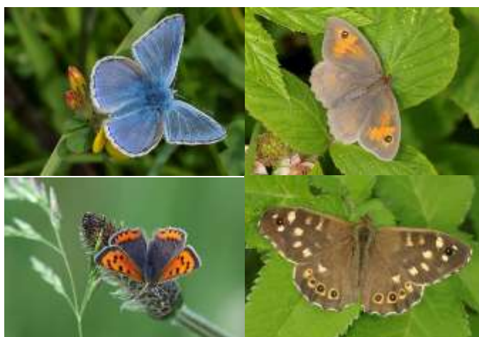
Common blue (top left), meadow brown (top right), Small Copper (bottom left), speckled wood (bottom right).

Many of these butterfly species use the plants in the meadow for laying their eggs. Meadow Browns and Ringlets use common grasses such as Cock's-foot and the Common Blue butterfly uses Bird's-foot Trefoil and White Clover.