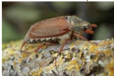
May bugs are a favourite food of greater horseshoe bats

If the dawn chorus is spectacular then dusk is the preserve of the bats which can be seen feeding along the treelines, around field edges and across the marsh. Seven species of bat have been recorded in this area. Greater Horseshoe, Common Pipistrelle, Whiskered and Natterers bats are all known to breed nearby. Night roosts of Soprano Pipistrelle and Brown Long-eared bats have also been found at farms nearby (night roosts are where bats rest up following their first feed at dusk). Noctule bats have also been recorded overhead, these bats are powerful flyers and often fly in the open well above the tree canopy.