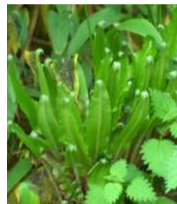
Hart's Tongue Fern