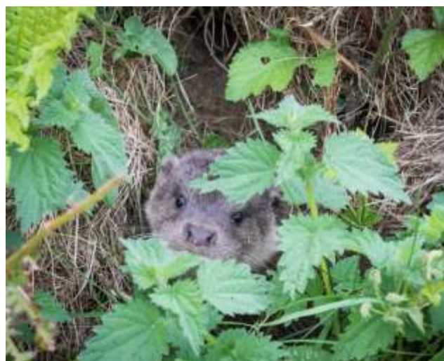
Otter Mike Baker

Otters are known to frequent the Brandy Brook, although they can be notoriously difficult to spot. The best times to see them tend to be dawn and dusk when things are quieter and there are less people around. When carrying out surveys for otters it is easier to look for 'spraint' (droppings), a dark tar like substance often with visible fish bones and a very distinctive sweet musky odour. They often leave this spraints in very specific areas to mark their territories for example on large prominent river rocks or under bridges.