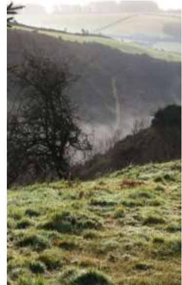
Footpath to Rhysnaston mountain

Because this area is less visited, with care here you can see some common and some more shy mammals such as Rabbit, Badger, Stoat and Grey Squirrel. Hares and Polecats have also been seen close to Rhydnaston Mountain.