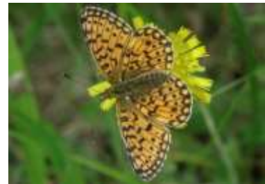
Small Pearl-bordered fritillary

You may also catch sight of one of our rarer butterflies, the Small Pearl-Bordered fritillary which breeds along this stretch of coast. It can be hard to distinguish from its larger relative, the Dark Green Fritillary which also occurs here. The larvae of this butterfly feed on Dog Violet which occurs in the more bracken rich areas of the coast, flowering early before the bracken canopy closes over.