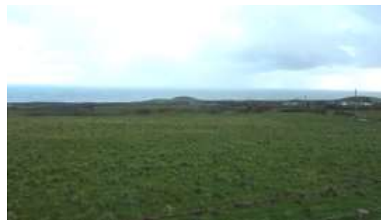
Looking from near Llanwnda to Crincoed Point