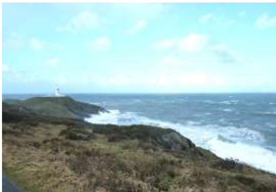
Strumble Head and lighthouse in high winds