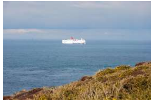
Irish ferry offshore approaching Fishguard near Strumble Head