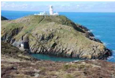
Strumble Head lighthouse showing cliffs in calm weather