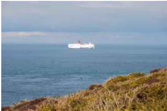
Sea with ferry leaving area for waters closer to Fishguard