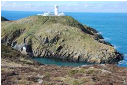
Sea beyond the Strumble Head lighthouse