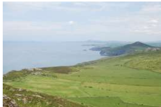
Carn Penberry from Carn Llidi looking north east