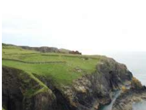
Porth Ffynnon- west of Porthgain- with quarry building