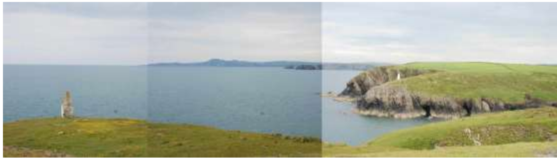
Porthgain harbour markers looking north east towards Strumble Head