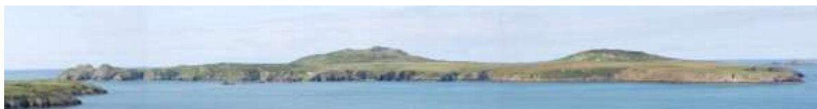
Ramsey Island from the east