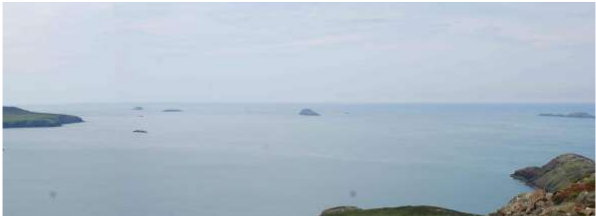
View of the Bishops and Clerks from Carn Llidi. Ramsey Island lies to the left and St Davids Head to the right.