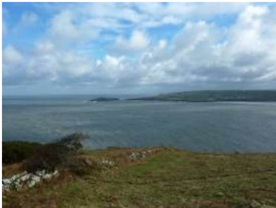
Looking across the bay to Cardigan Island