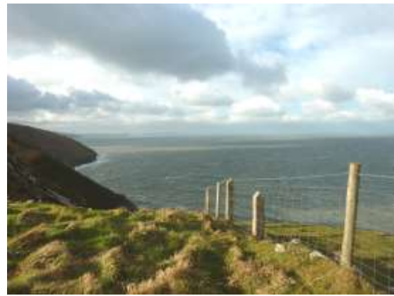
Looking west from Cemaes Head