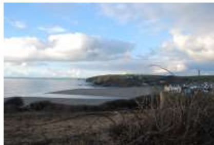
View across Broad Haven beach