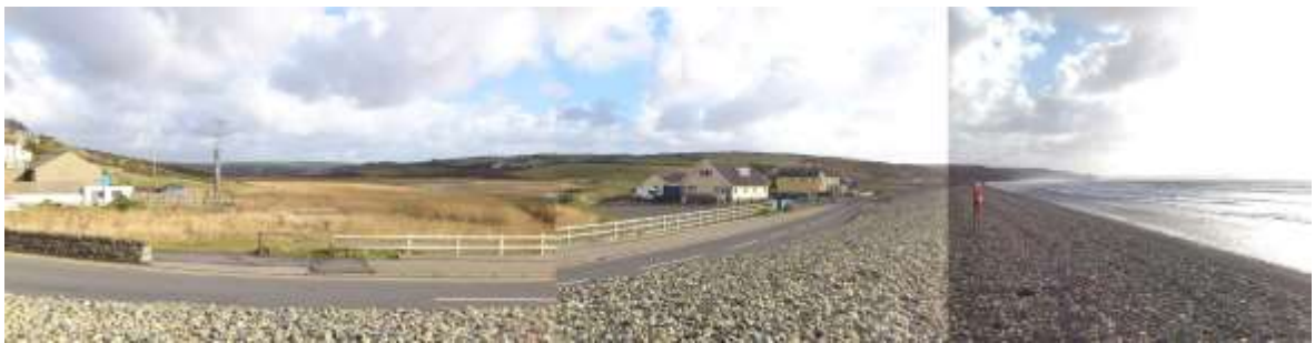
Looking south from Newnole