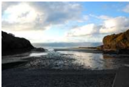
View from Little Haven across St Bride's Bay