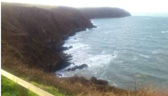
Looking west towards Borough Head