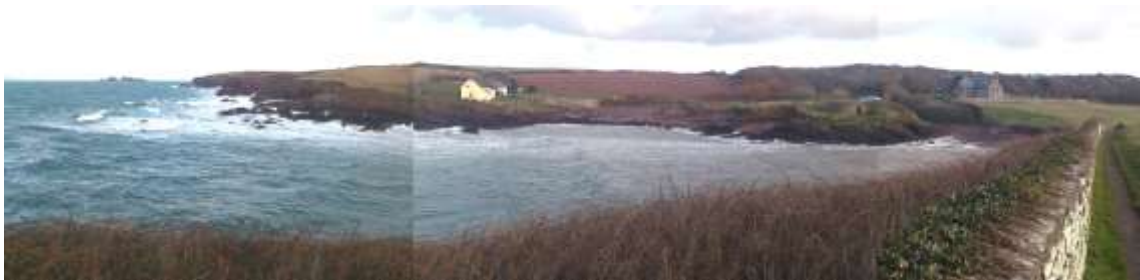
St Brides Haven, Stack Rocks offshore in distance