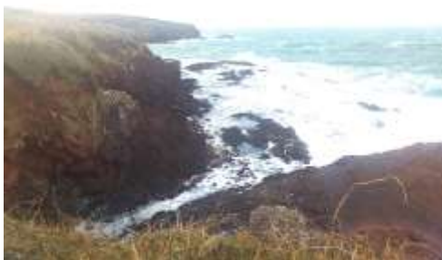
West towards Huntsman's Leap