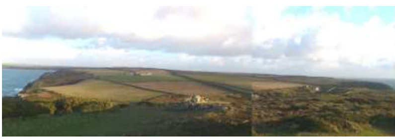
Marloes peninsula looking east