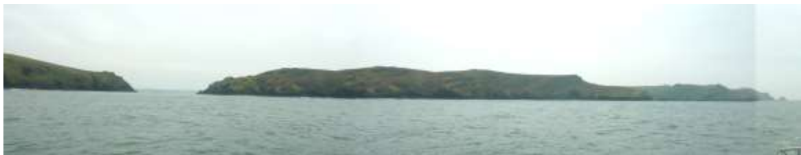
Looking to Skomer from the sea, approximately 500m to the north