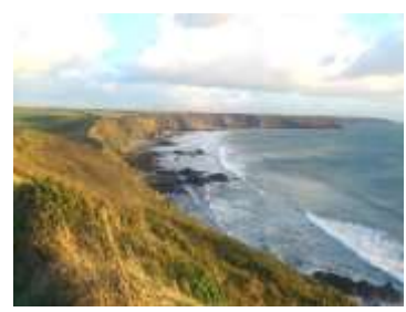
Marloes Sands looking south east