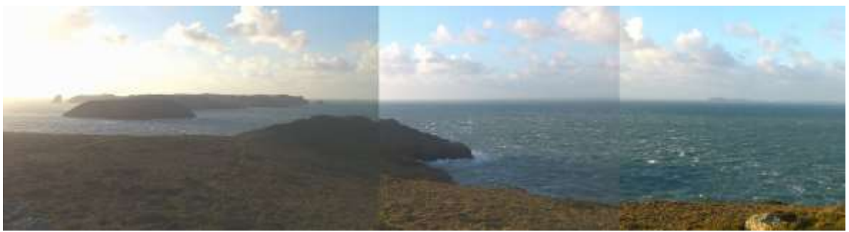
Looking to Skomer (left) from Haven Point CG lookout, with Ramsey Island visible across St Brides Bay to north (right)