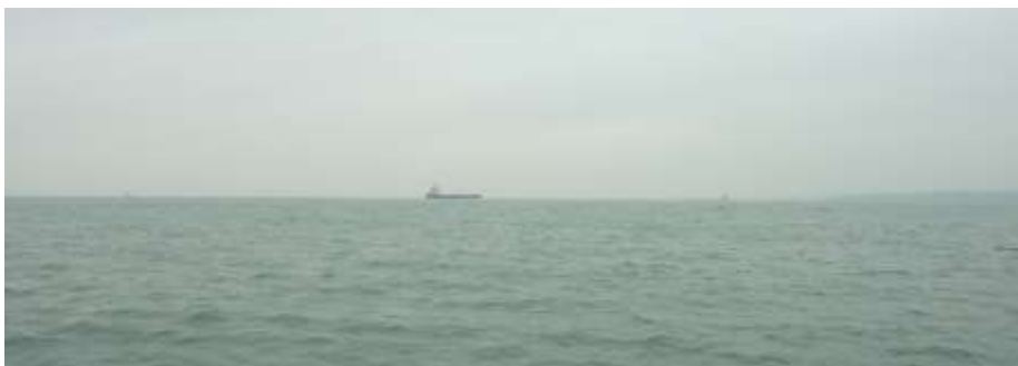
View of area at Sea north east of Skomer