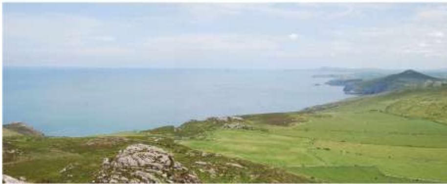
View of northern component of area from Carn Llidi with SCA 13 in middle ground