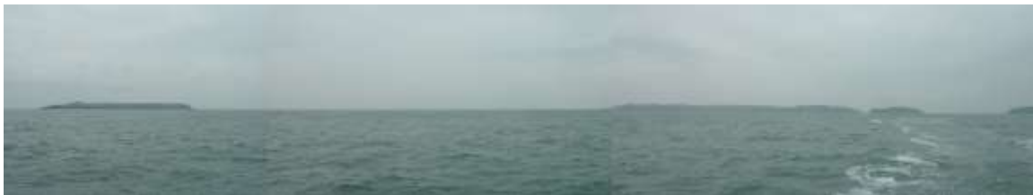
Area viewed between Skokholm and Skomer at sea