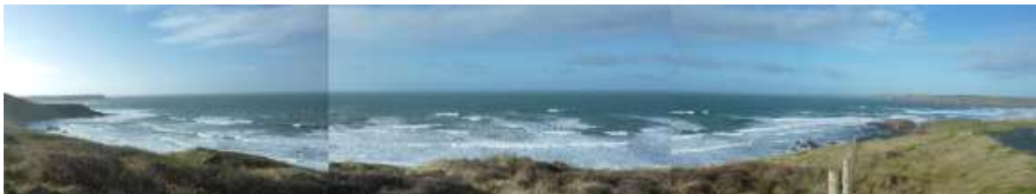
Area out to sea from Freshwater West (in SCA34)