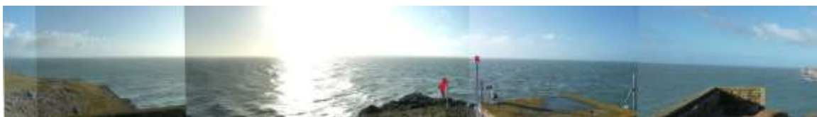
Area out to sea from St Govan's Head (in SCA35)