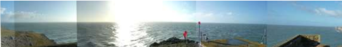
Area out to sea on horizon viewed from St Govan's Head (in SCA35) beyond SCA29