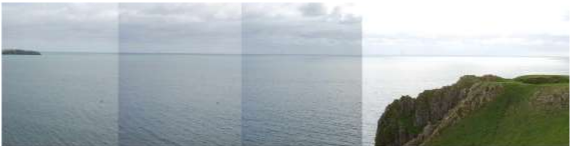
Area out to sea on horizon viewed from Lydstep Point beyond SCA37

Summary Description This very large area stretches off the south coast from Caldey Island in the east, running south and west to 42km offshore. It is mainly moderately deep. The east forms the setting to Caldey Island and the area is busier as part of the approaches to Milford Haven to the west as well as