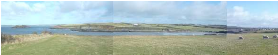
Panorama looking north over Angle Bay, refinery visible on right