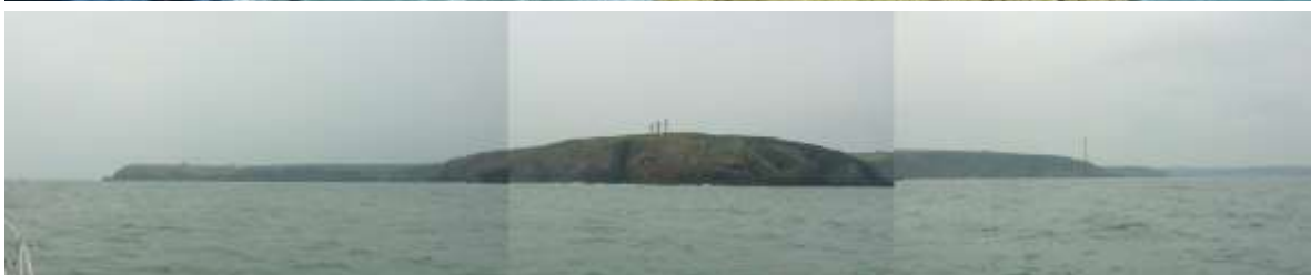
In the mouth of the Sound approx 500m from shore