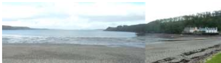
Dale Roads with refinery in distance