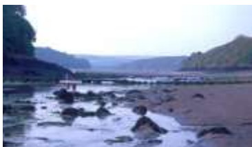
Sandyhaven Pill