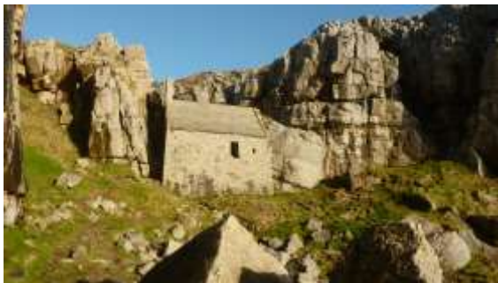
St Govan's Chapel with channelled views out to sea