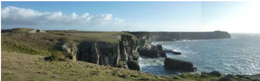
St Govan's Head from the west