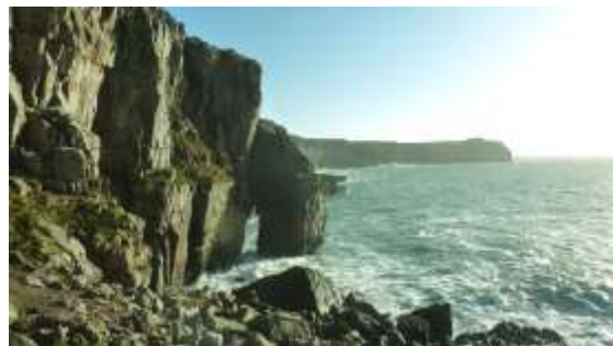
Rocks and arches under limestone cliffs