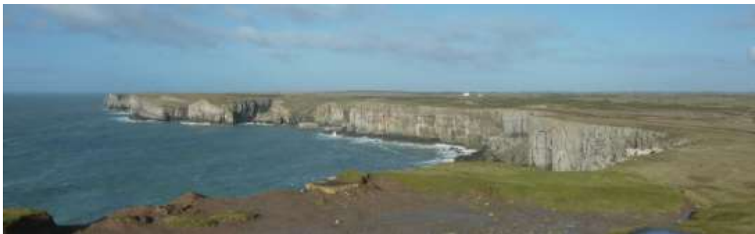
Looking west from St Govan's Head