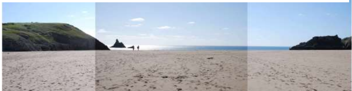
Broad Haven beach looking towards Church Rock