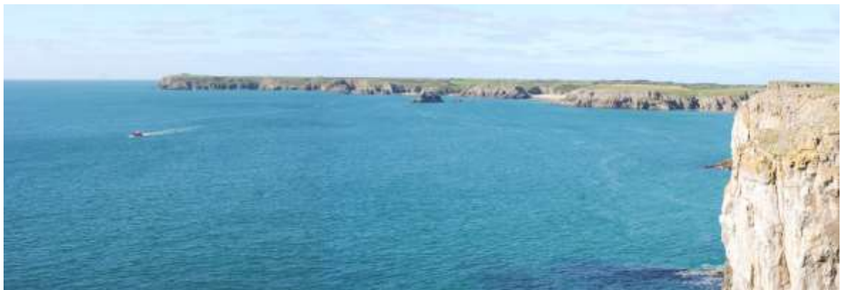
View to St Govan's Head from Stackpole Head