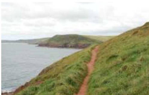
Cliff path on the Priest's Nose looking west