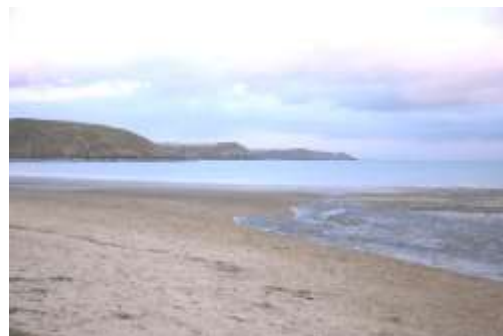
Freshwater East looking east