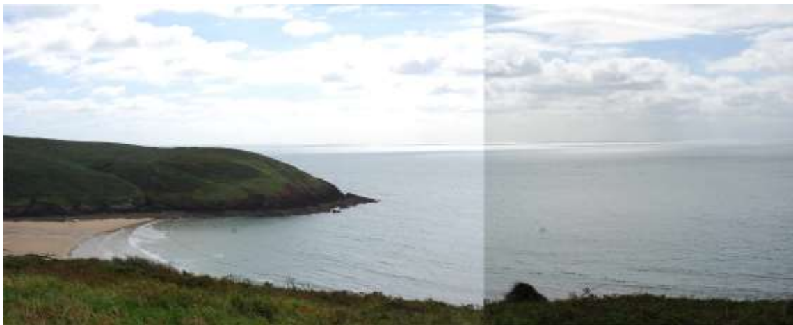
Manorbier beach and the Priest's Nose