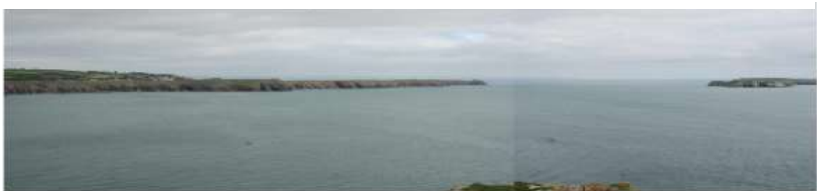
Looking east from Lydstep Point to Caldey Sound