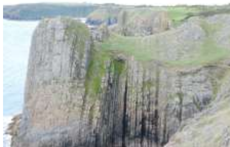
Whitesheet Rock from Lydstep Point looking west