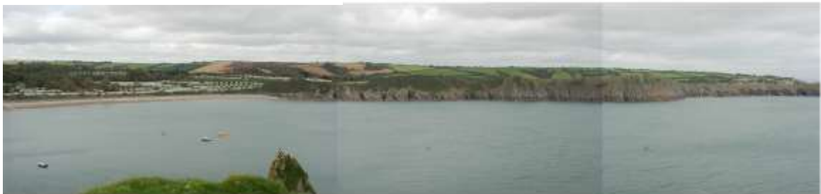
Lydstep Bay from Lydstep Point