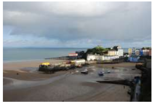
Tenby North Beach with harbour