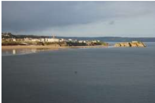
Tenby with view from the south