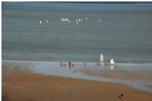
Tenby- sailing dinghy activity off North Beach