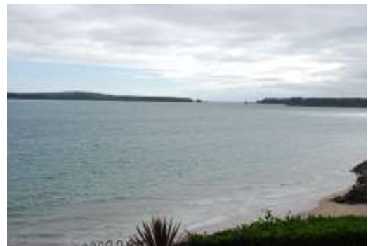
View across to Caldey island from South Beach