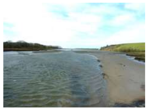
Afon Nyfer estuary