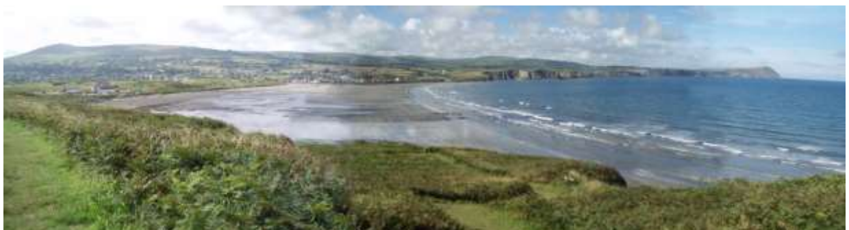
Newport Bay from Trwyn y Bwa