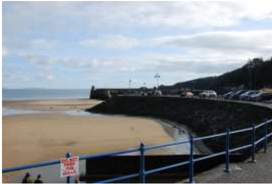
Saundersfoot harbour and beach