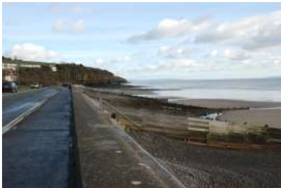
Amroth- sea wall and groyne