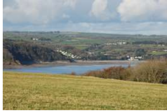
Caravan parks and woodland on the coast- Wiseman's Bridge