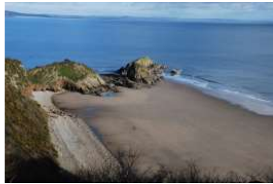
Monkstone Beach illustrating natural beauty