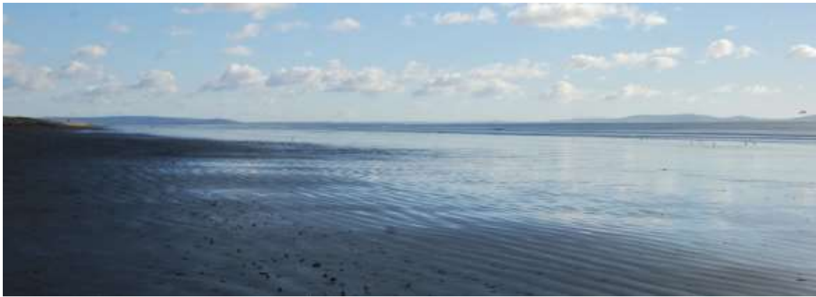
View south east across Carmarthen Bay towards the Gower