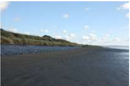
View east along Pembrey Sands