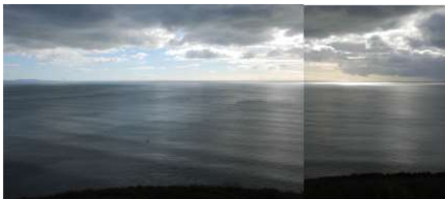
Area over horizon from Pendine Sands in Carmarthen Bay- Rhossili Downs lies to east and Caldey Island to west