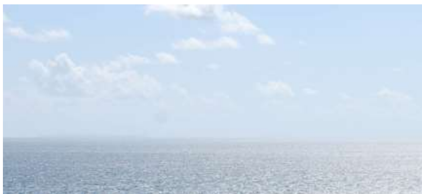
Area between coast and Lundy Island on the horizon [to the left] [View from Gower].