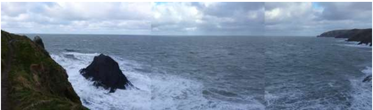
Area visible on horizon from Ceihwr Bay