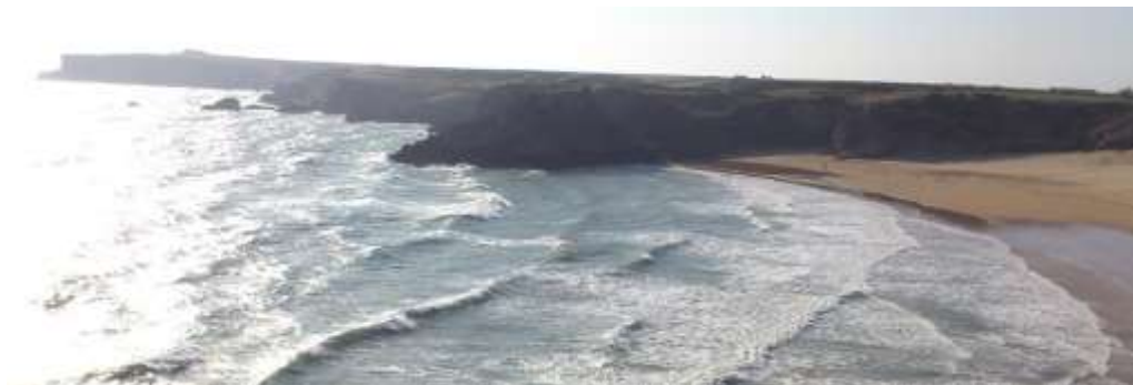
Waves at Broadhaven (South)