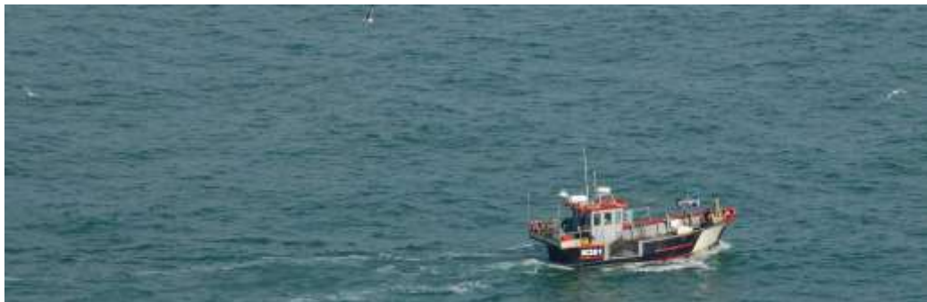
Potting fishing vessel off Strumble Head