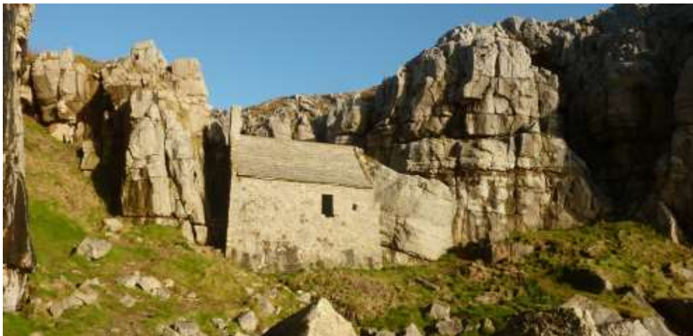
St Govan's Chapel