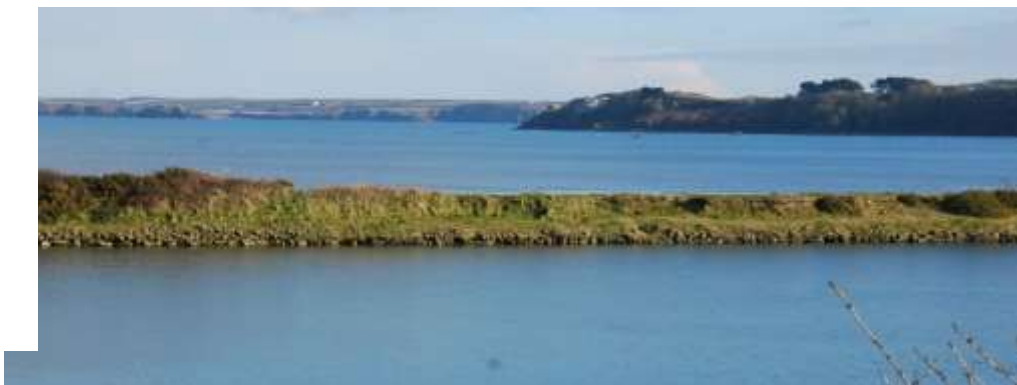
Lagoon at Dale

former hosts eel-grass beds and saltmarsh and a coastal lagoon lies at Gann, Dale. The area is an important feeding ground for wildfowl and waders such as wintering teal, wigeon, curlew and shelduck. Otters are found around the Daugleddau . Migratory fish including sewin (sea trout) and salmon are found in many watercourses, for example in the Teifi.