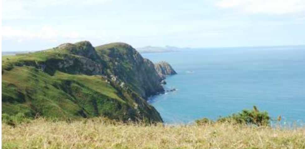
High cliffs at Penbwchdy

the period were formed in warm shallow, fossiliferous seas (brachiopods, corals). Towards the end of the Silurian a transition from marine to non-marine conditions is shown by the change to red-bed deposition of the Old Red Sandstone (e.g. St Anne's Head at 46mAOD high, Freshwater West with its wave cut platform, Freshwater East and Pendine). This continues into the Devonian, represented by red sandstones and mudstones laid down on coastal plains, mudflats, salt marshes and in braided rivers. These terrestrial environments were inhabited by early plants, armoured fish and amphibians. The collision of continents created folds and faults which is widely evident in the cliffs of north Pembrokeshire (e.g. Abereiddi Bay).