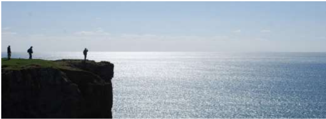
Stackpole Head- panoramic views