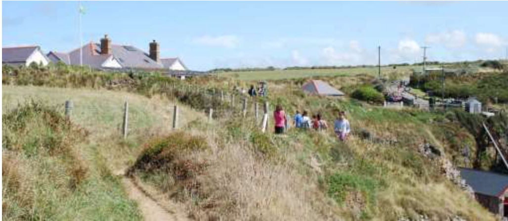
Coast Path at St Justinians- a popular stretch