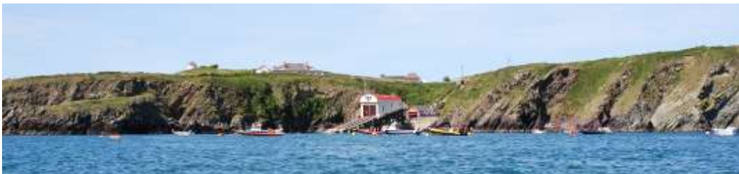
St Justinians from Ramsey Sound