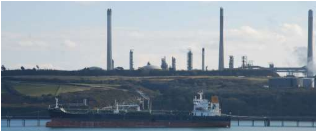
Milford Haven- refinery