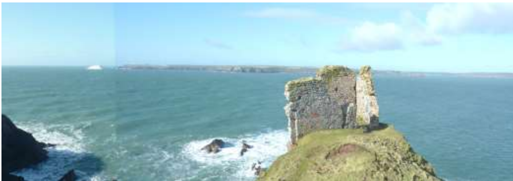
The mouth of Milford Haven