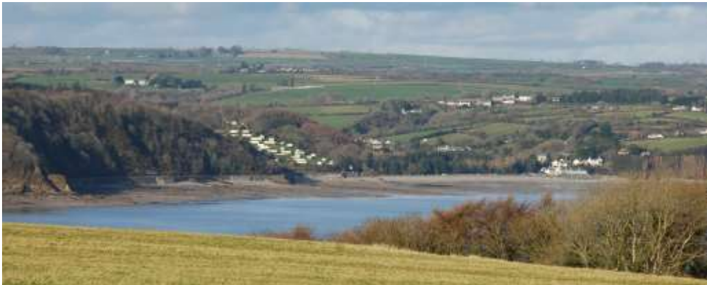
Caravans at Wiseman's Bridge