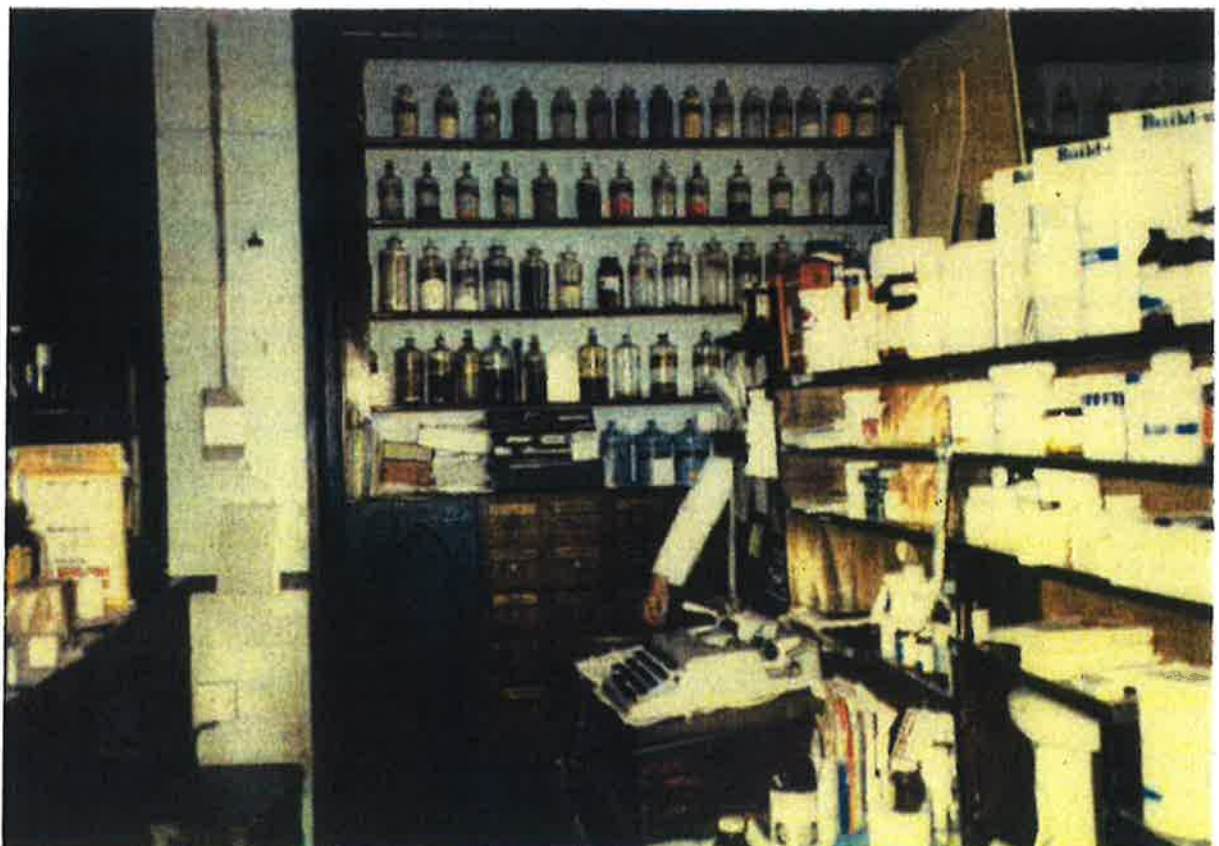
Photograph C – fixtures to rear wall of shop (shown on left) prior to removal