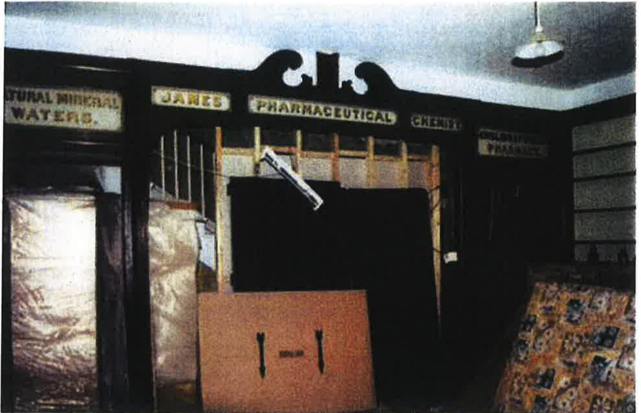
Photograph B – fixtures to rear wall of shop showing historic finish and exposed insets