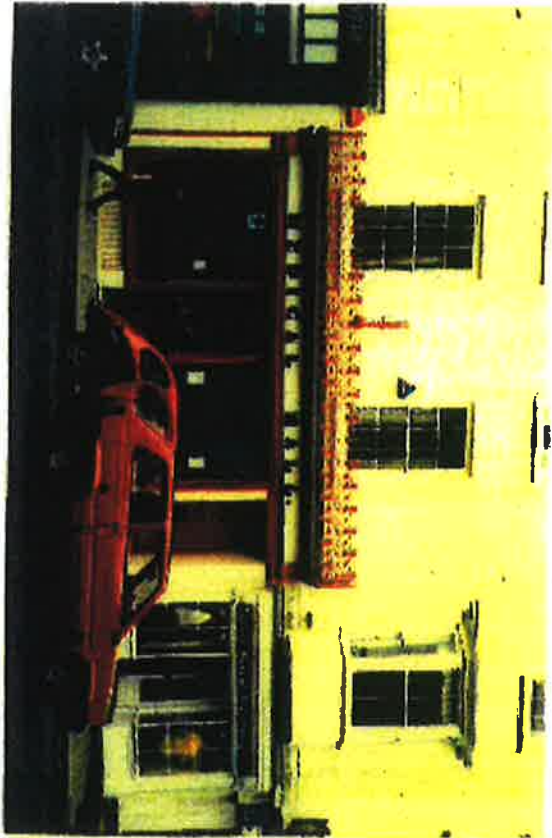
Photograph A – Shopfront prior to alteration showing paired doors