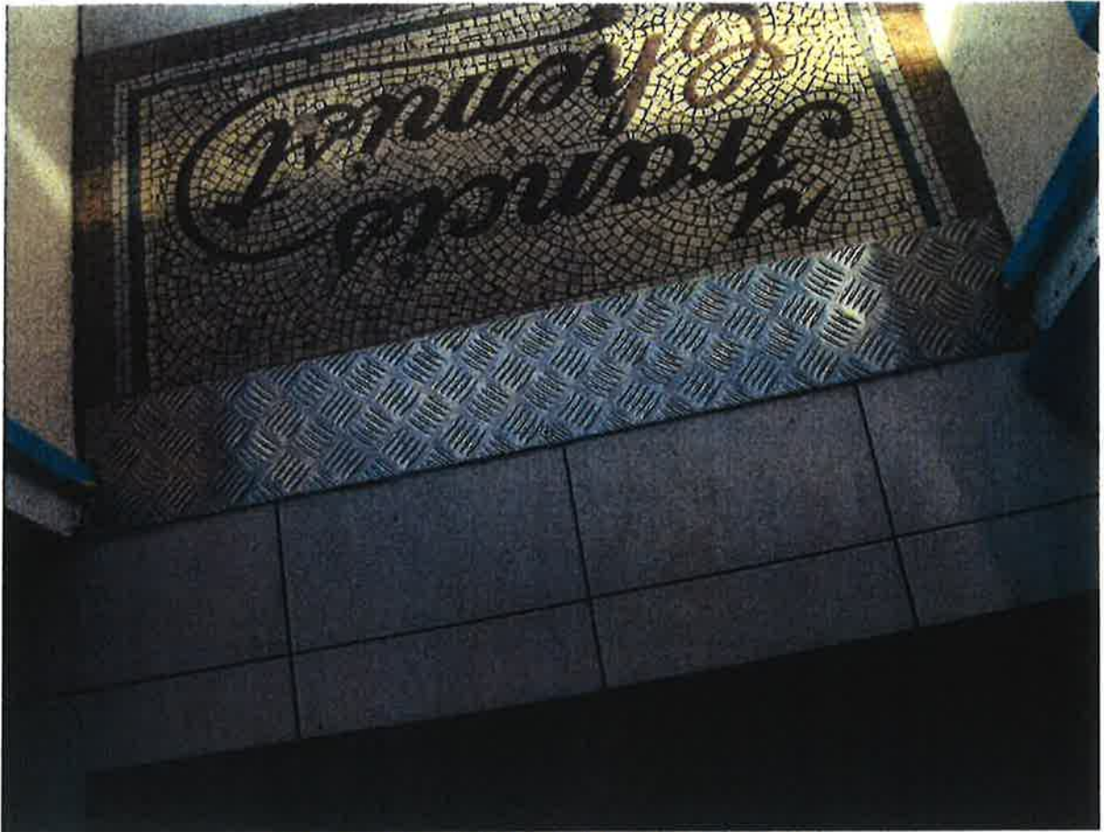
Photograph F – steel plate installed to threshold 2016