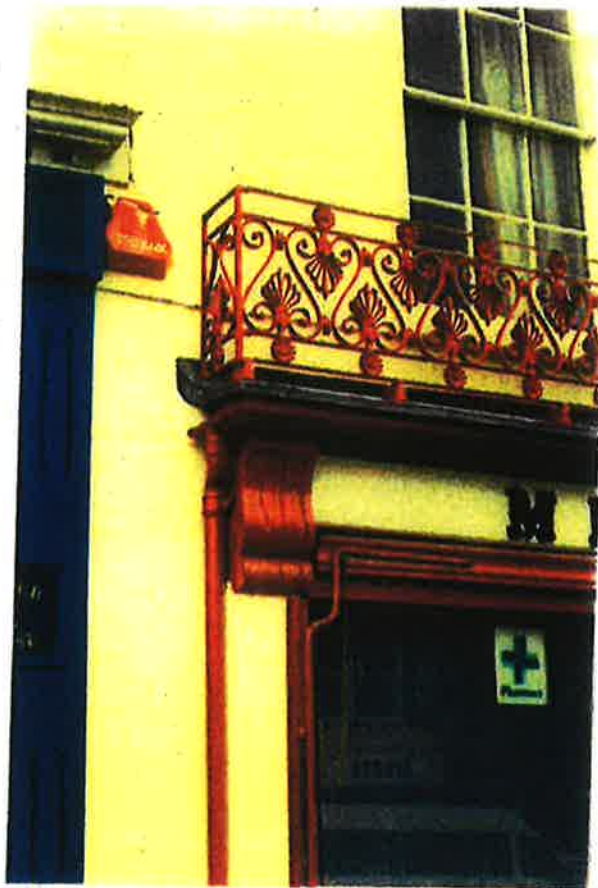
Photograph G – raised lettering to fascia prior to removal