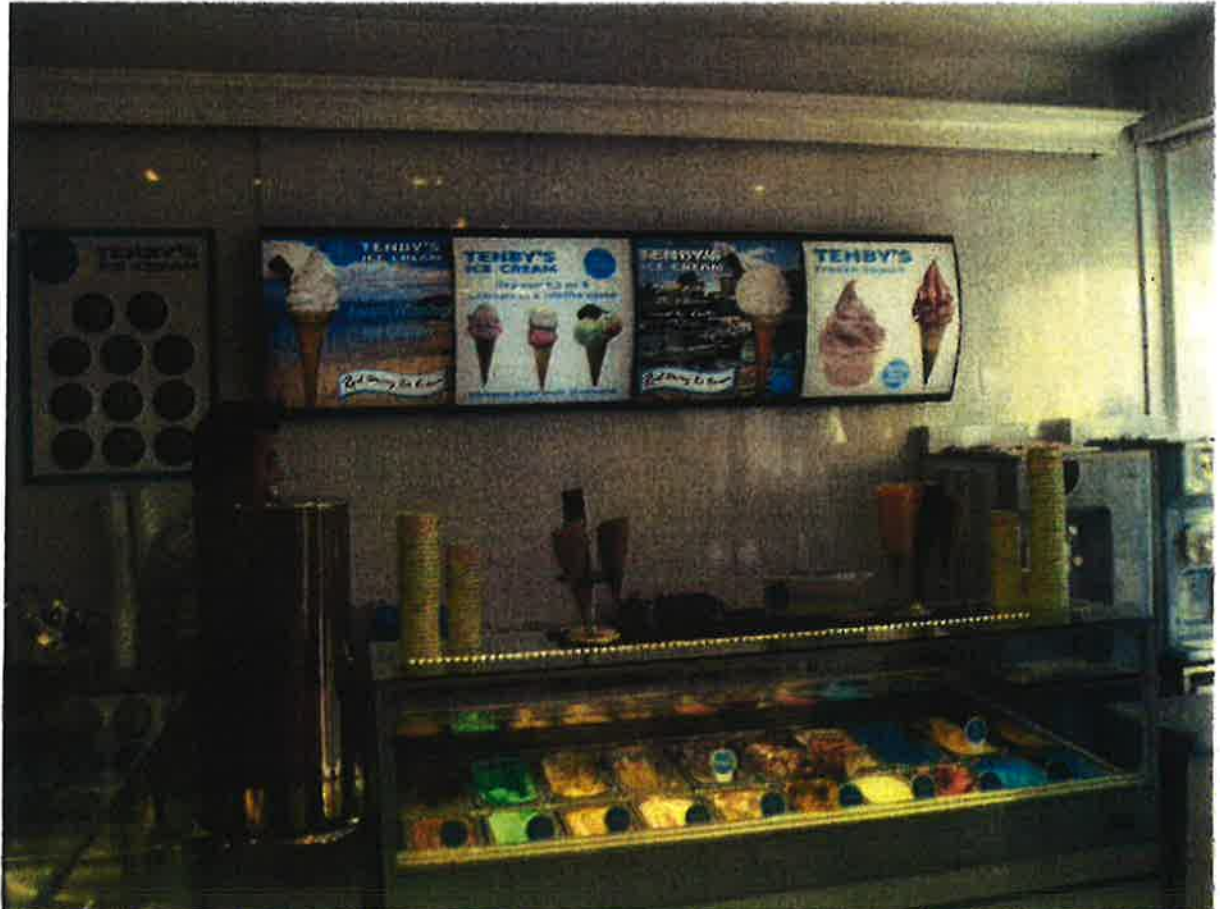
Photograph E – paneling and illuminated panels installed 2016