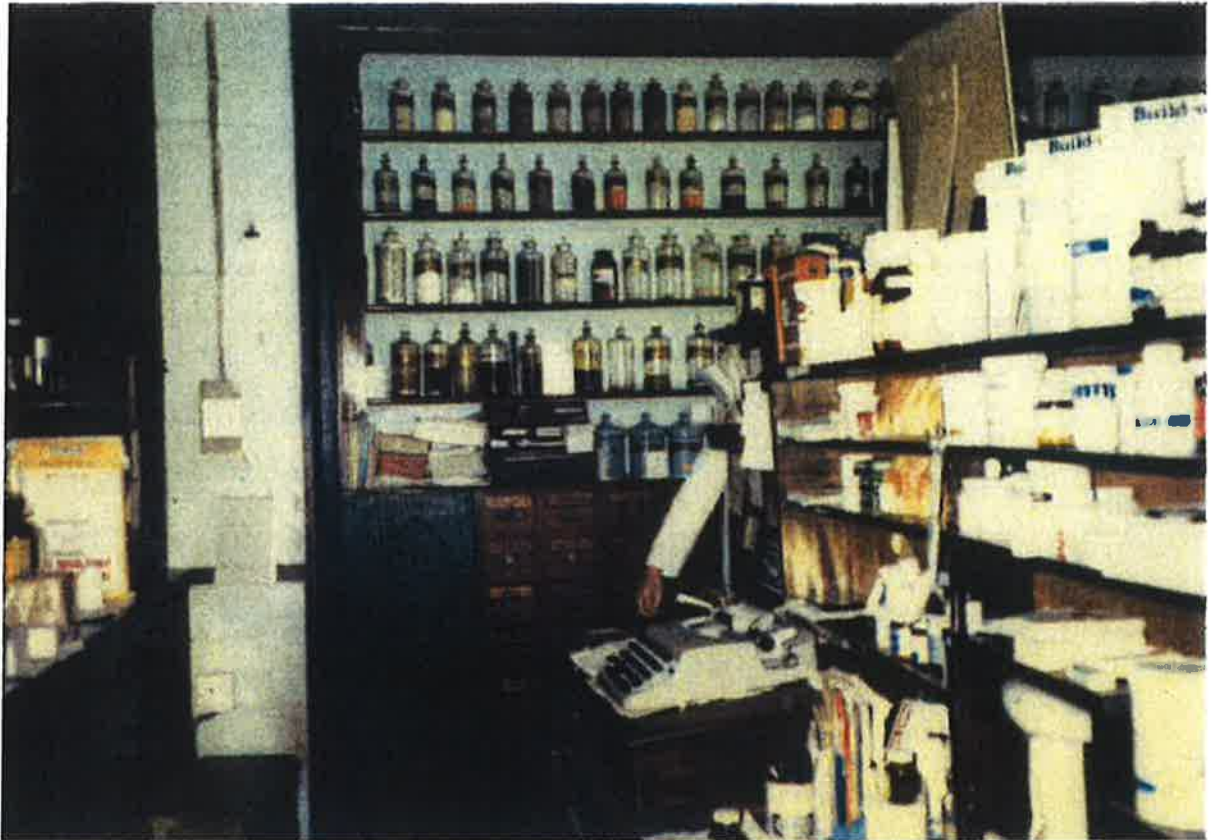
Photograph D – fixtures to right-hand wall of shop prior to removal