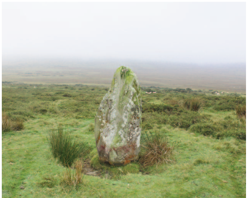
Standing stone at the westernmost portion of the site near the track.