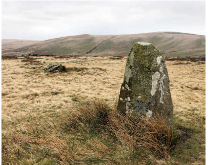
Standing stone at the eastern portion of Waun Mawn with one of the former standing stones laying flat in the background.

Caution: Parking is limited to two laybys shown on the map; please do not park in gateways or passing places. The land is designated a Special Area of Conservation, a Site of Special Scientific Interest and a Scheduled Monument and protected by law. Unauthorised disturbance or damage is a criminal offence. Please respect this protected landscape, its archaeology and natural habitat. Please keep dogs on leads as sheep graze here.