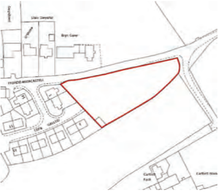
LOCATION PLAN LICENCE NUMBER = 100012067 SCALE 1:2500