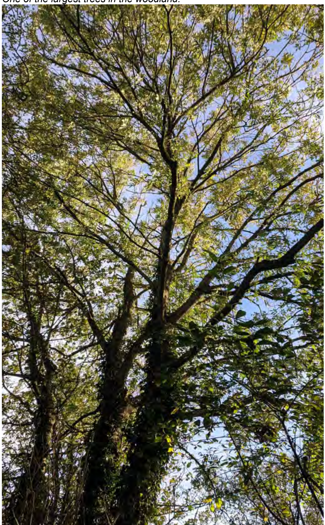
Image 6 T8 – Overview of Ash – with some dieback observed. One of the largest trees in the woodland.