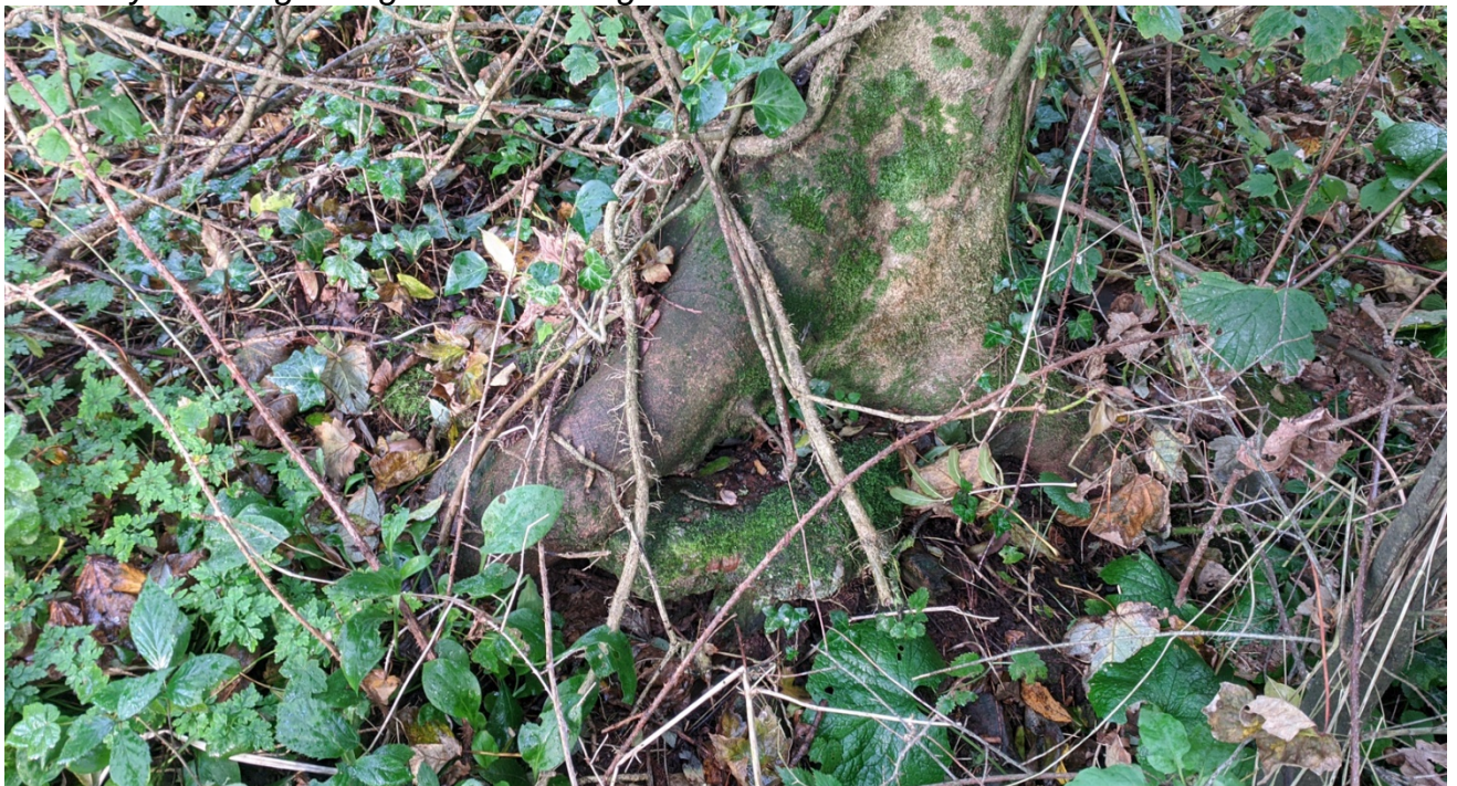
T14 – Sycamore growing on the existing ‘inter-war’ wall fabric.