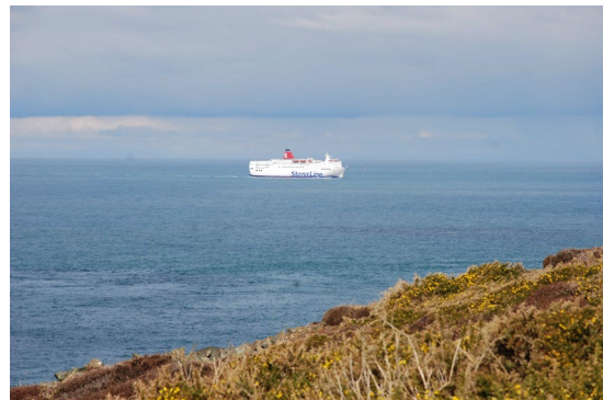
Sea with ferry leaving area for waters closer to Fishguard [taken from SCA 10]