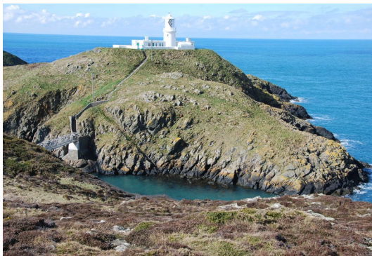
Sea beyond the Strumble Head lighthouse [taken from SCA 11]