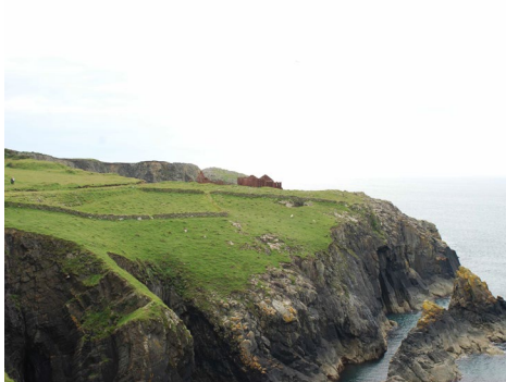
Porth Ffynnon- west of Porthgain- with quarry building