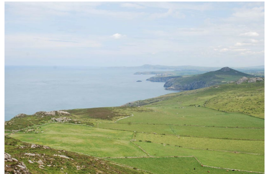
Carn Penberry from Carn Llidi looking north east