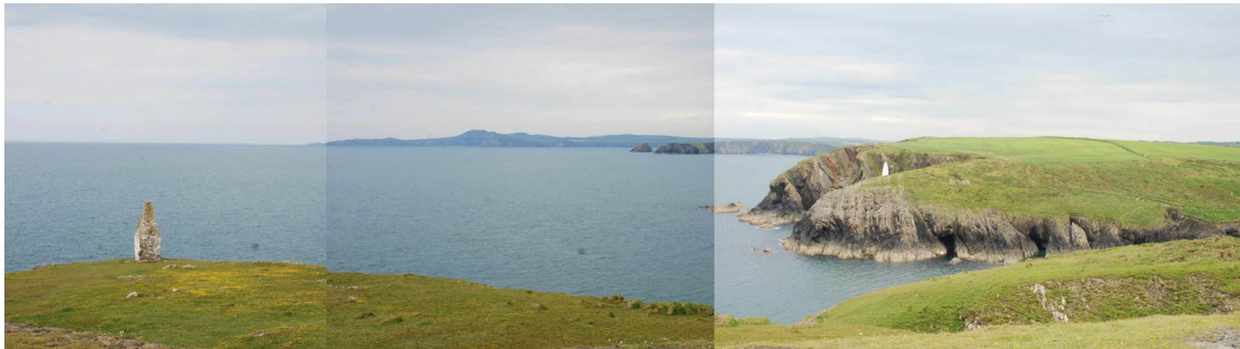
Porthgain harbour markers looking north east towards Strumble Head