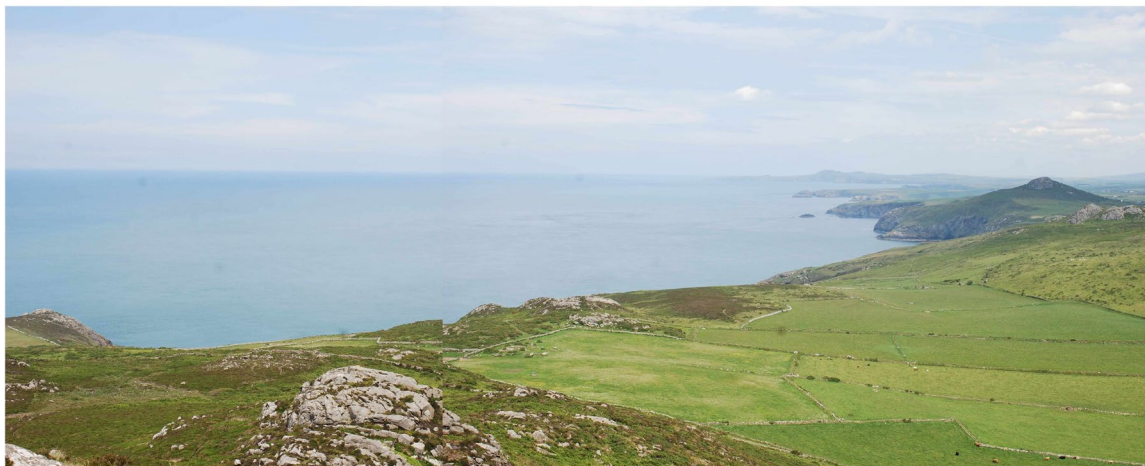
View of northern component of area from Carn Llidi in SCA14 with SCA13 and SCA28 in middle ground