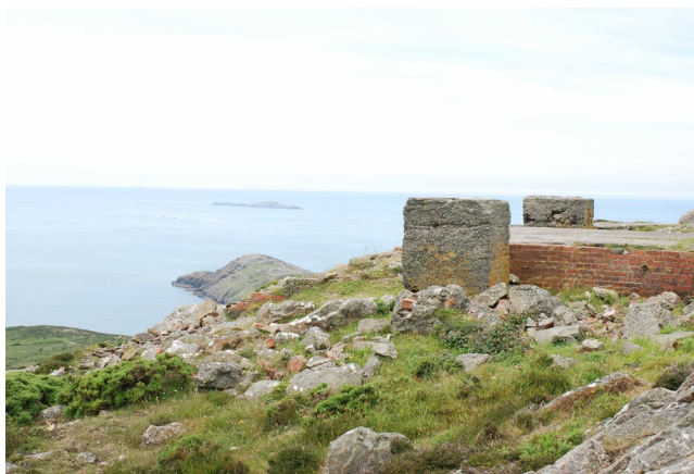
View west from Carn Llidi showing World War 2 remains