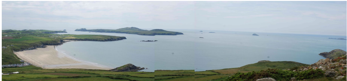
View of the Bay and Ramsey Island from Carn Llidi