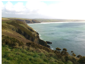
East from near Dinas Fach