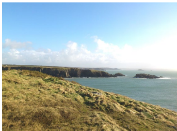
East from Caerfai Bay