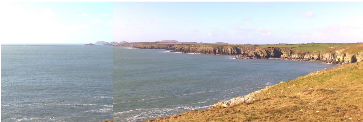
Looking west from near Caerfai to Ramsey Island in distance