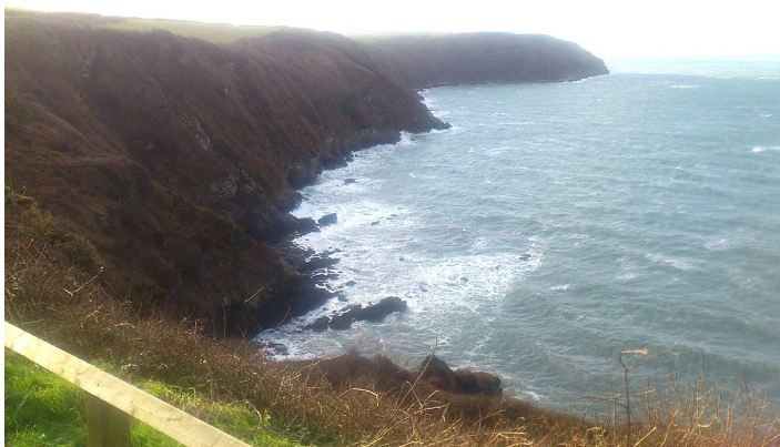
Looking west towards Borough Head